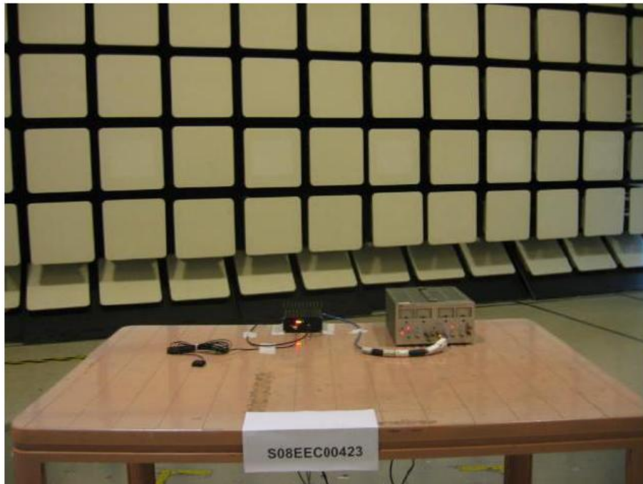
Radiated Emissions Test Setup (Front View)