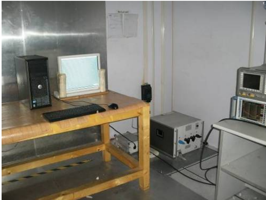
Test photo of Conducted emission