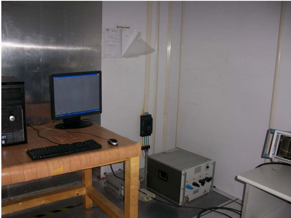
Test photo of Conducted emission