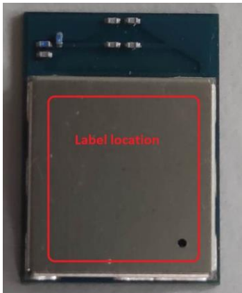
Figure 3: Label location of the MAYA-W1 modules

The modules are SMT components shipped to the OEM-integrator on Tape&Reel packed in a sealed Dry-Pac bag and mounted onto the host board by automatic “Pick&Place” machines. As the module is a surface mount device that is soldered onto the host it is not possible to place the label on the secondary side of the module.