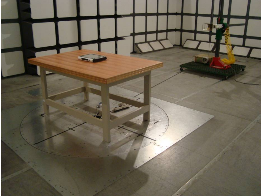
Above 1 GHz: Radiated Emissions - Rear View