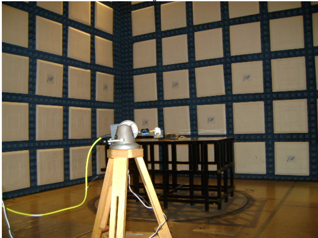
Test Setup for Radiated Emissions – 18GHz to 25GHz- Horizontal Polarization