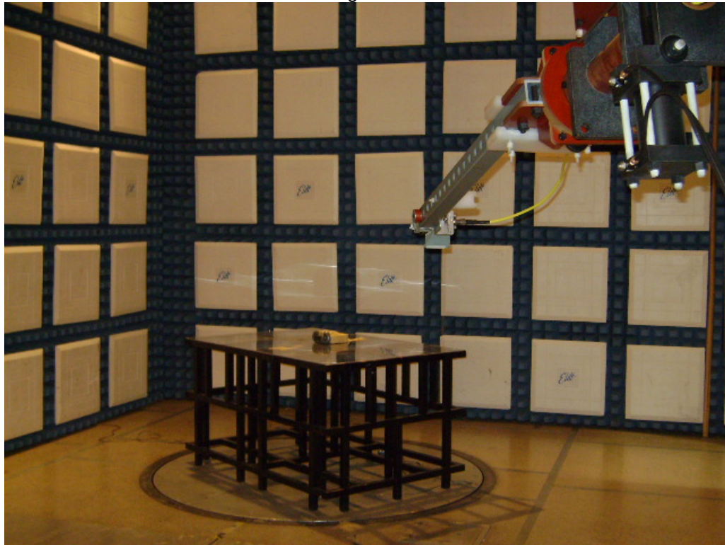
Test Setup for Radiated Emissions – 2GHz to 18GHz – Horizontal Polarization