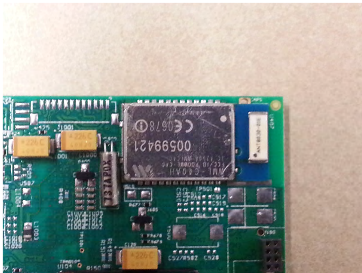
Zoomed – Bluetooth Module with antenna