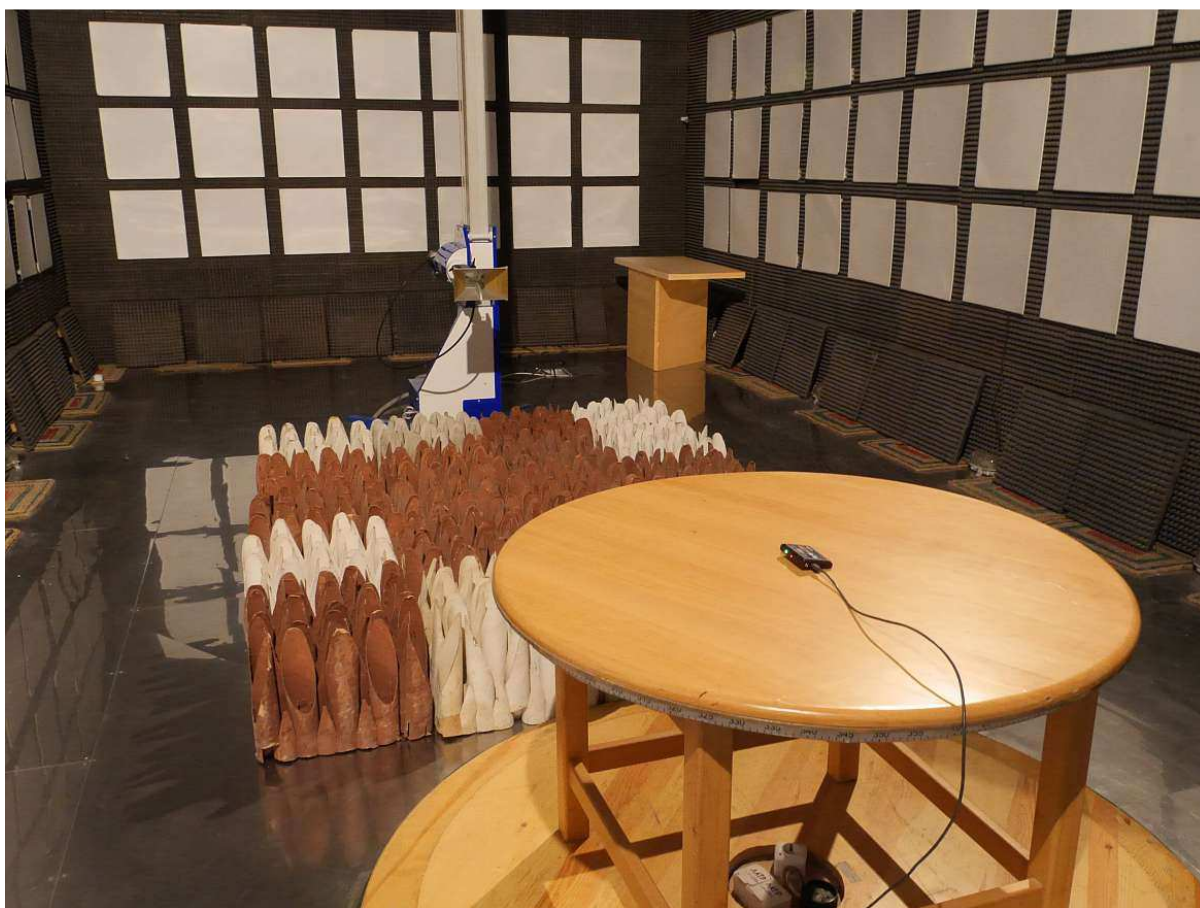
Figure 5 Radiated Emission Test