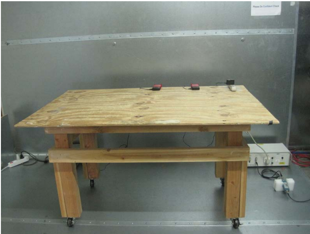
Conducted Emission Front View