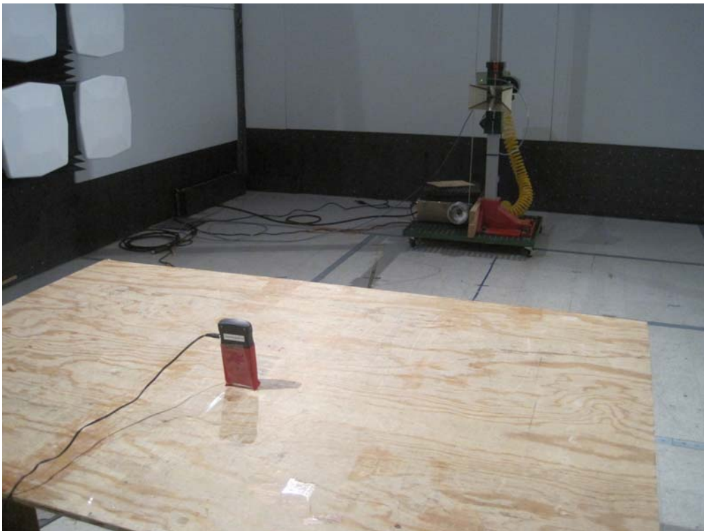
Radiated Emission Rear View(>1GHz)