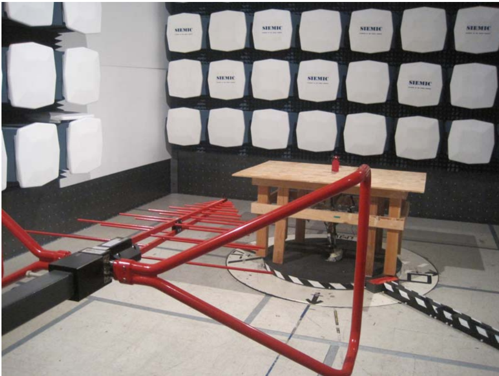
Radiated Emission Front View (< 1GHz)