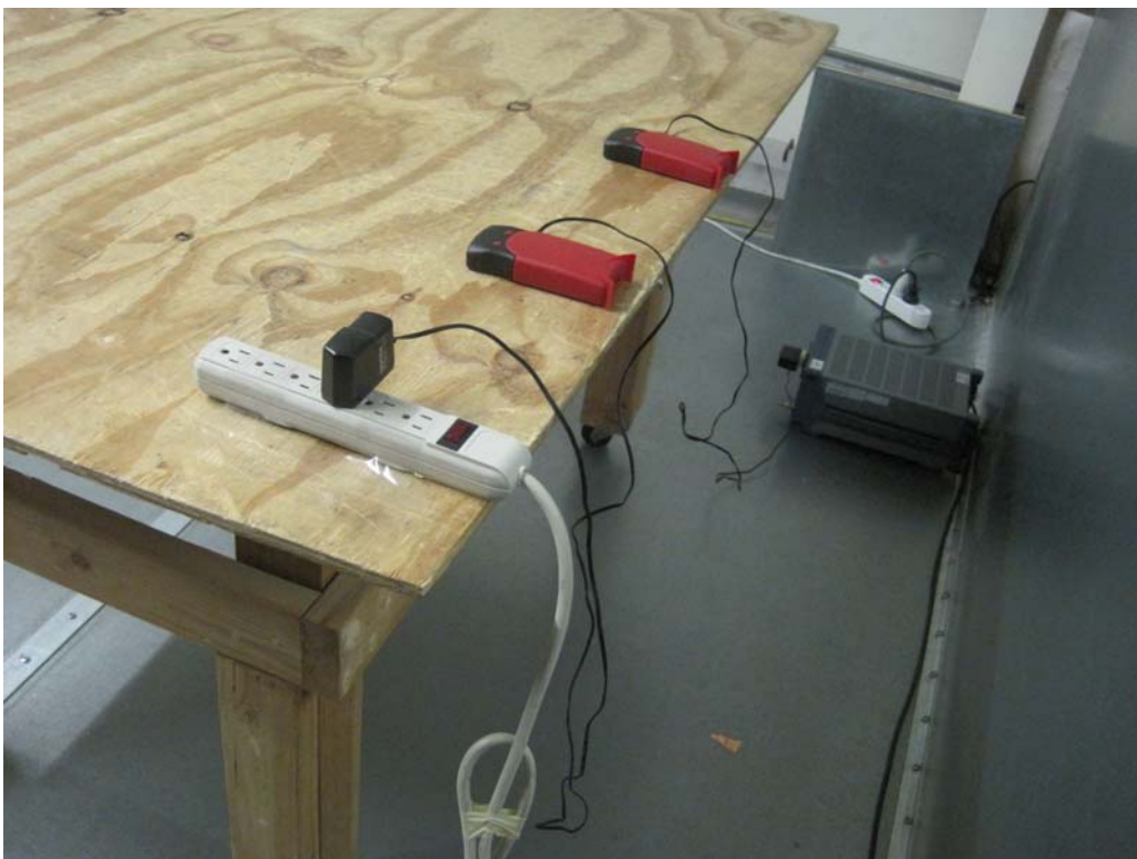
Conducted Emission Rear View