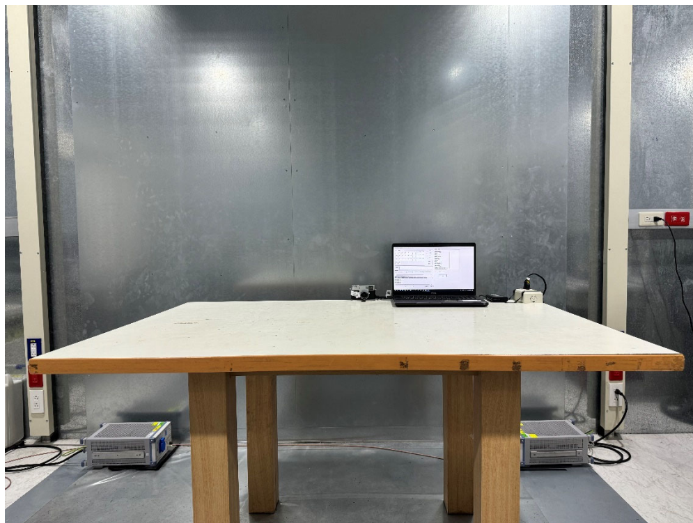
Back View of AC Power Line Conducted Emission Test