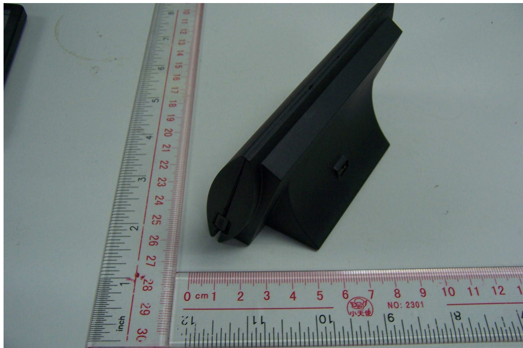
Fig. 2: Top view