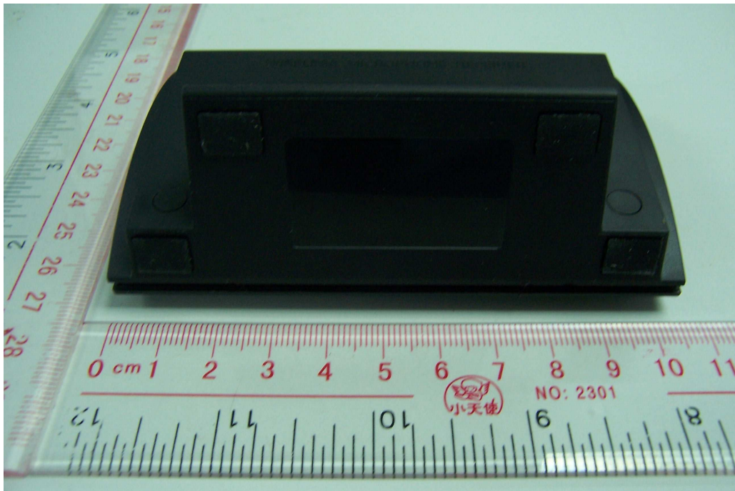
Fig. 4: Bottom view