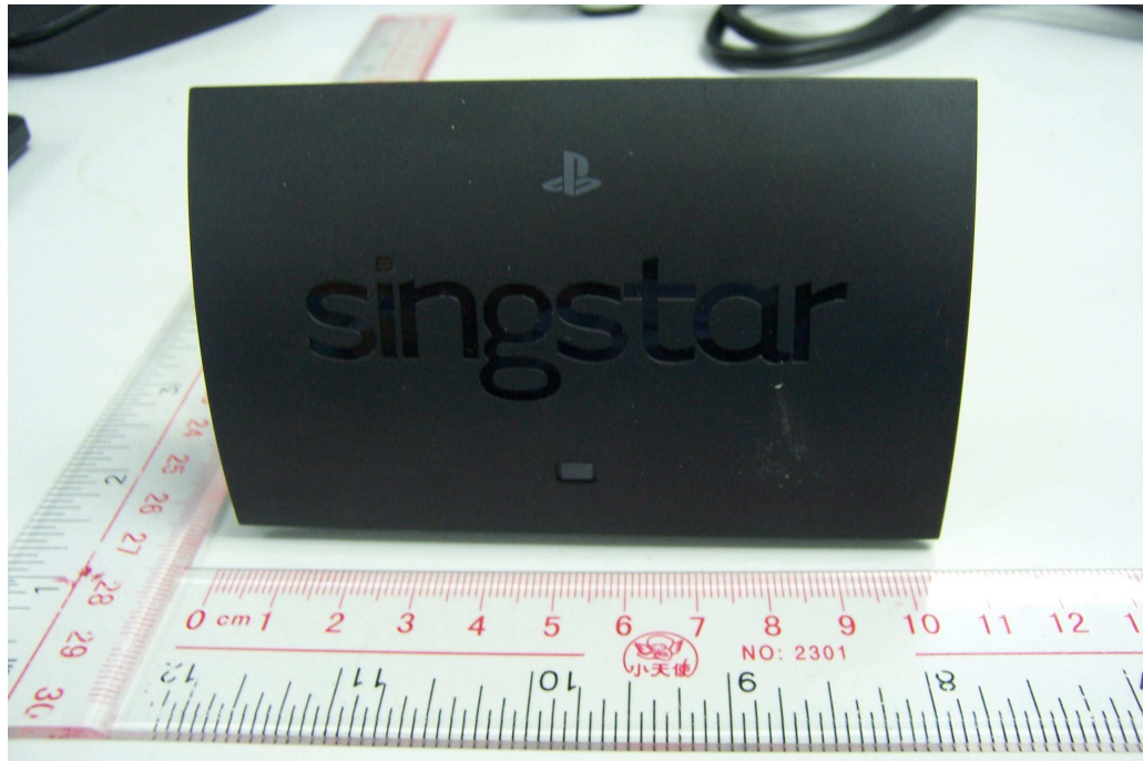
Fig. 1: Front view