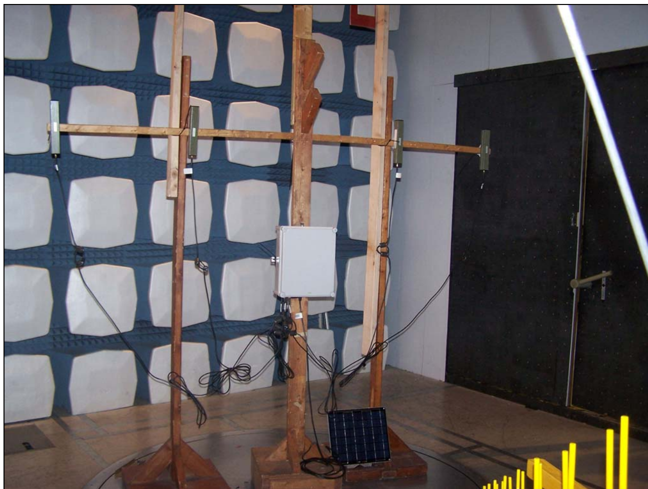
Photograph 1. Radiated Emission Limits Test Setup