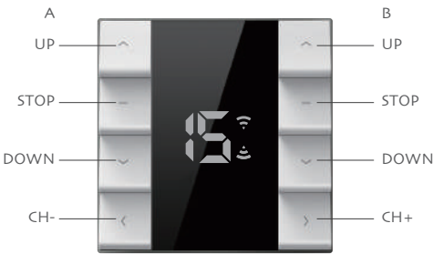
15-channel dual control emitter

Note: 1,For the emitters without setting button like DD2152HF, you can press up button and stop button at the same time to work as the same function as setting button. 2,After the operation is completed, after the back cover of the emitter is closed, please screw on Turnbuckle of the back cover.