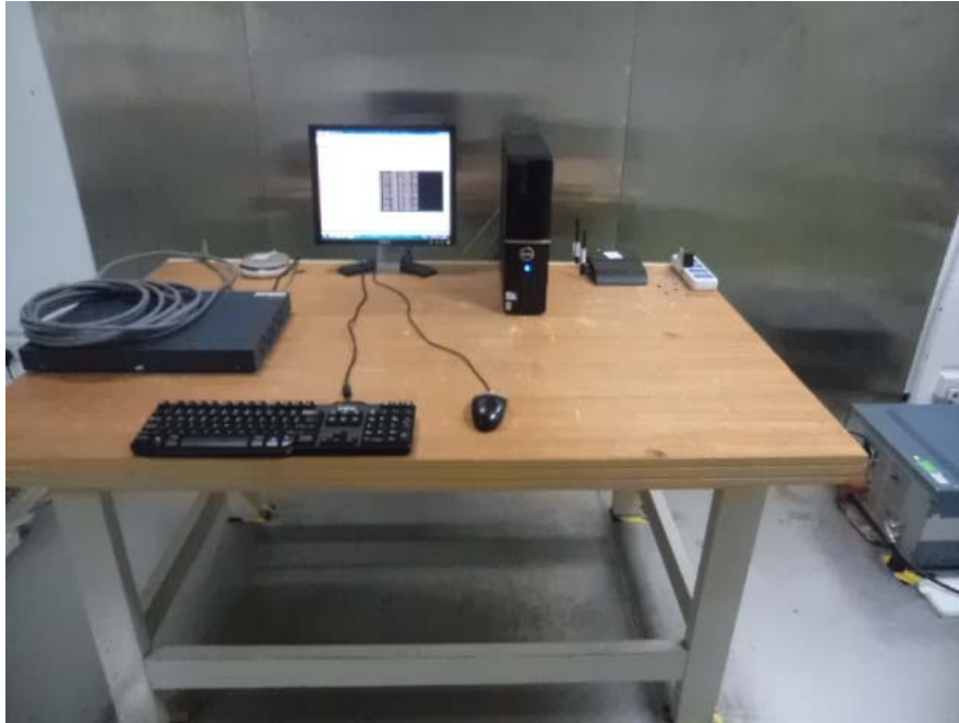
Conducted Emissions- Side View