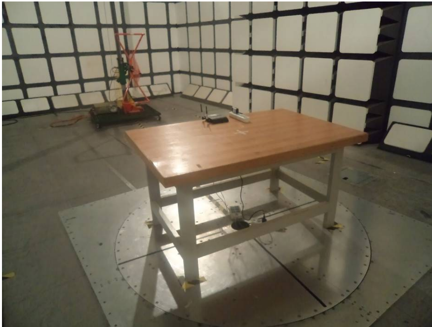
Spurious Radiated Emissions – Rear View (30 MHz - 1 GHz)