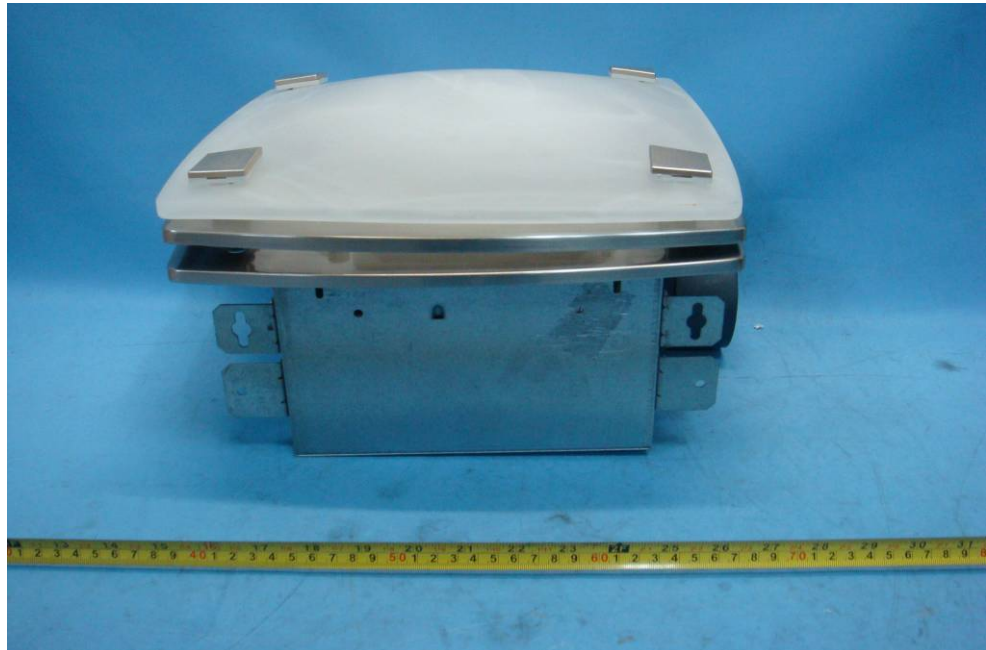
EUT with glass chimney-Back View