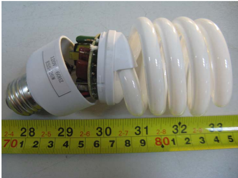
ESS-26W: EUT – Main Board Top View