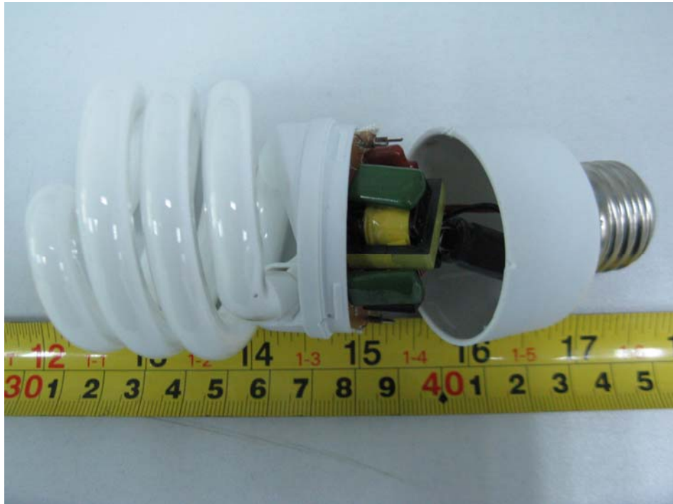
ESS-18W/20W: EUT – Main Board Top View