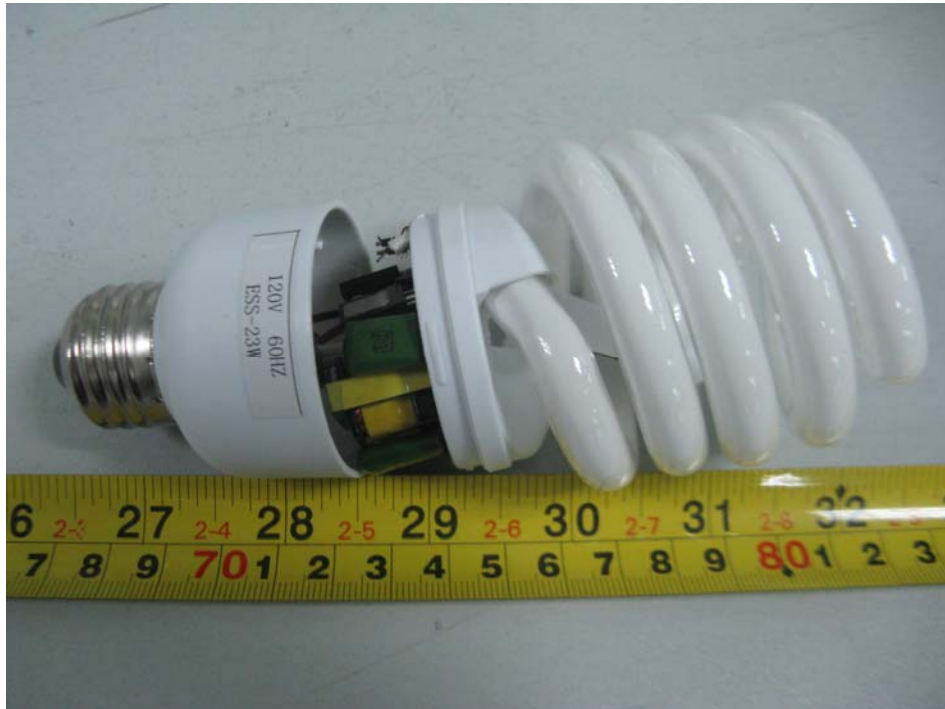
ESS-23W: EUT – Main Board Top View