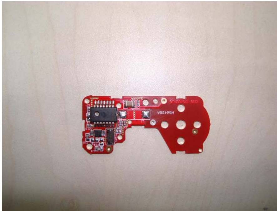
PCB Front View #2