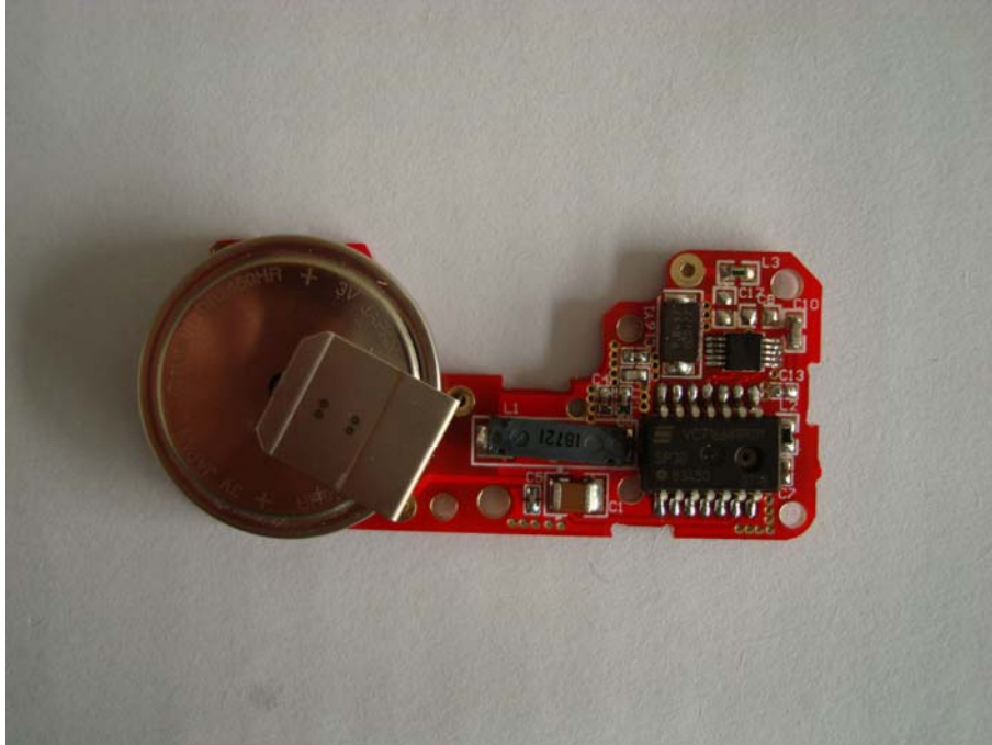
PCB Front View with Battery