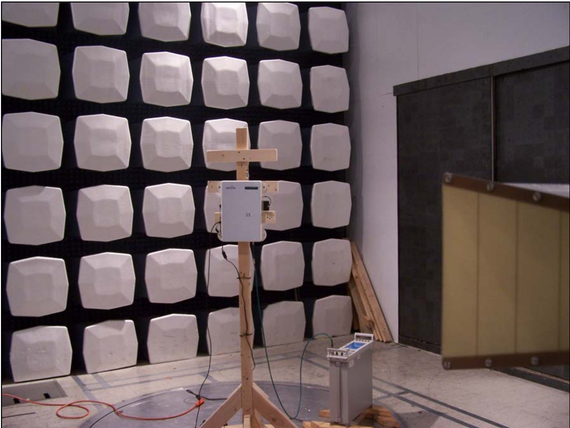
Photograph 1. Radiated Spurious Test Setup