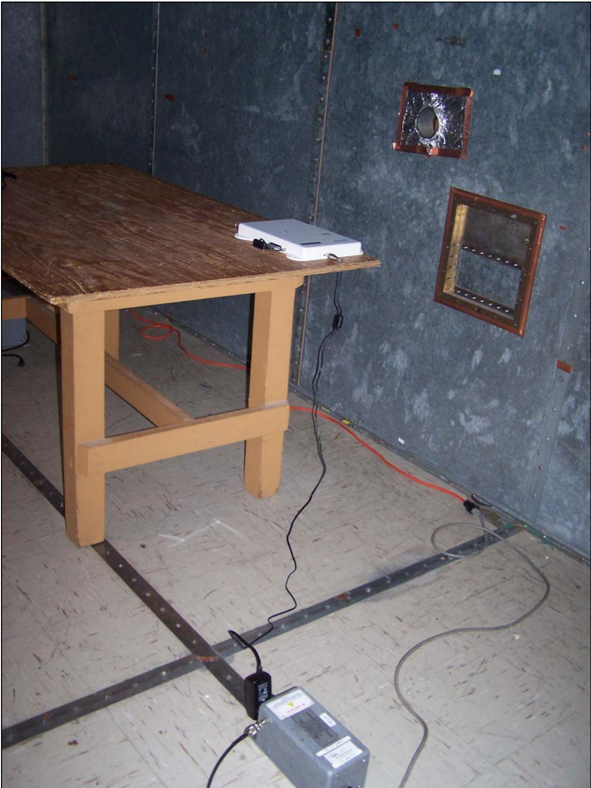
Photograph 2. Conducted Emissions Test Setup