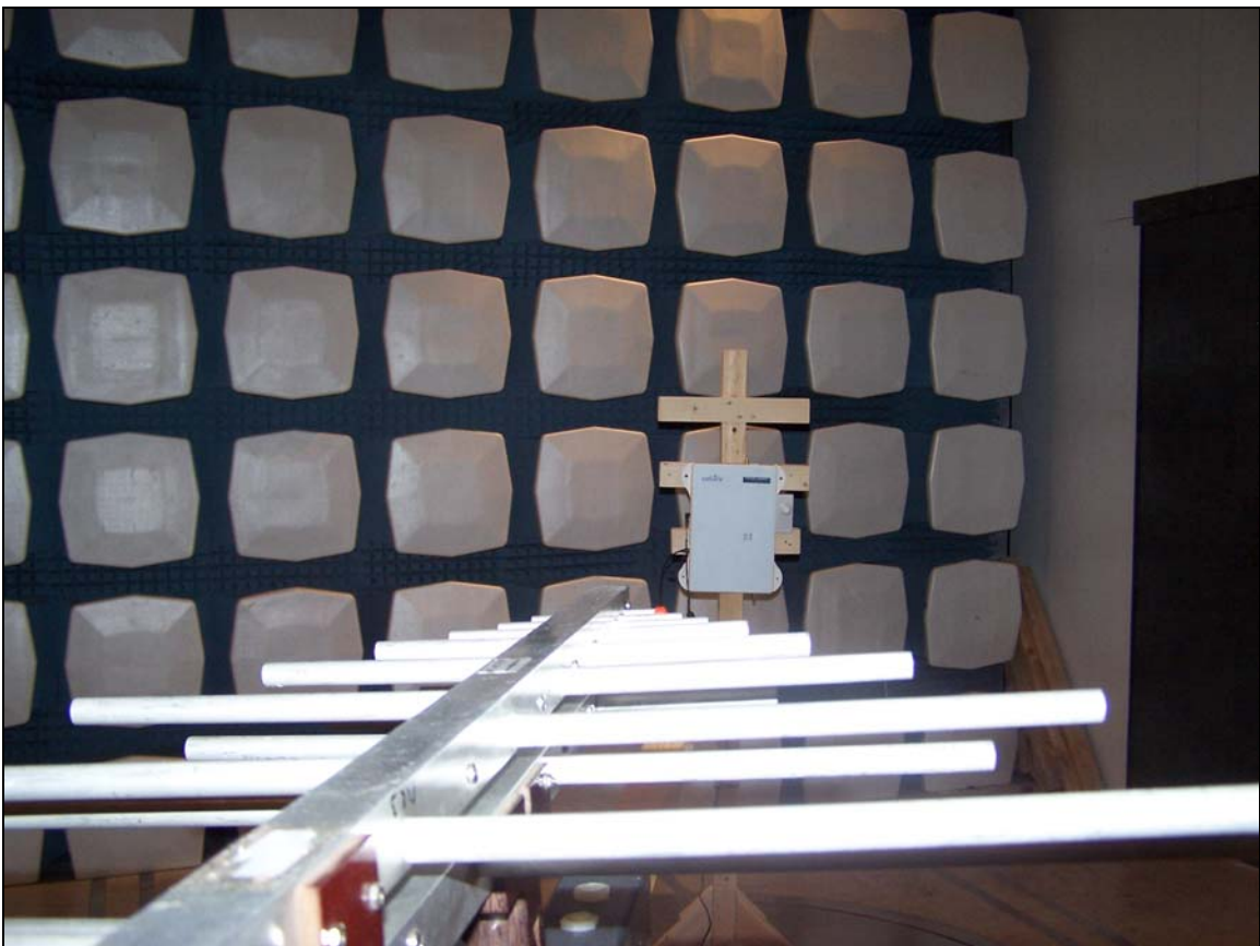
Photograph 4. Radiated Emissions, 200 MHz to 1000 MHz