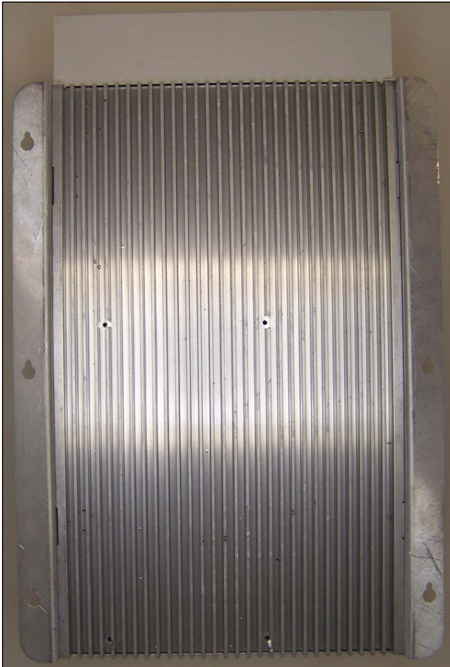
Photograph 1. Back View