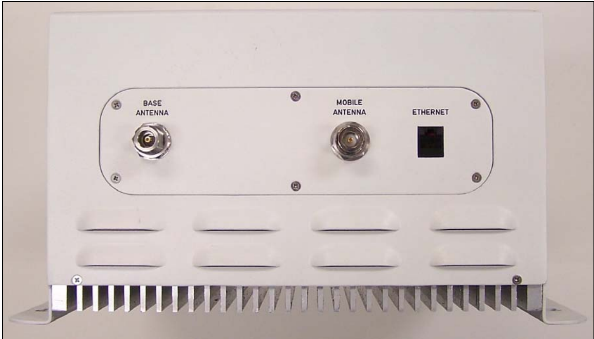
Photograph 2. Bottom with Alternate Connectors