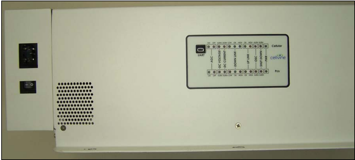
Photograph 4. Side View