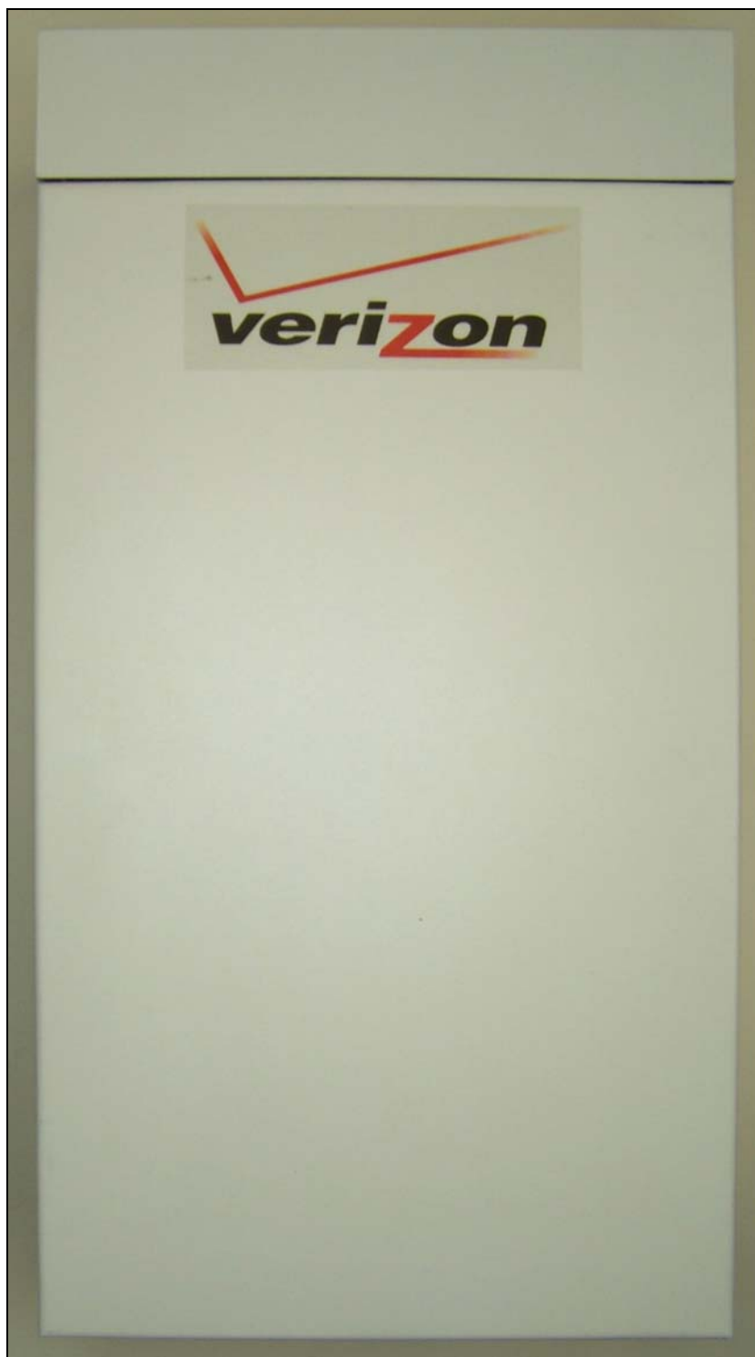
Photograph 3. Front View