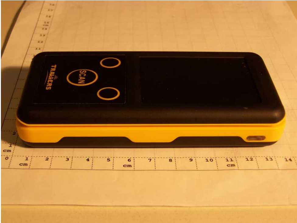
Photograph 5: Equipment under test: EUT A – right side view