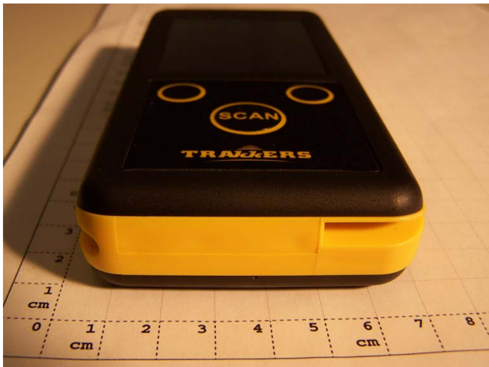
Photograph 4: Equipment under test: EUT A –under side view