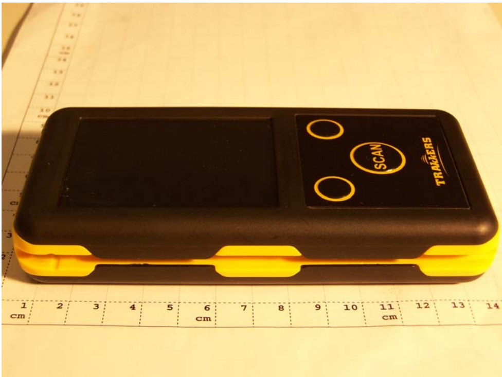
Photograph 6: Equipment under test: EUT A – left side view