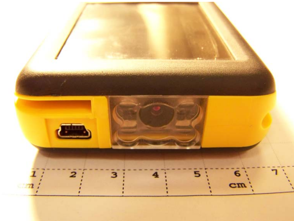
Photograph 3: Equipment under test: EUT A – top side view