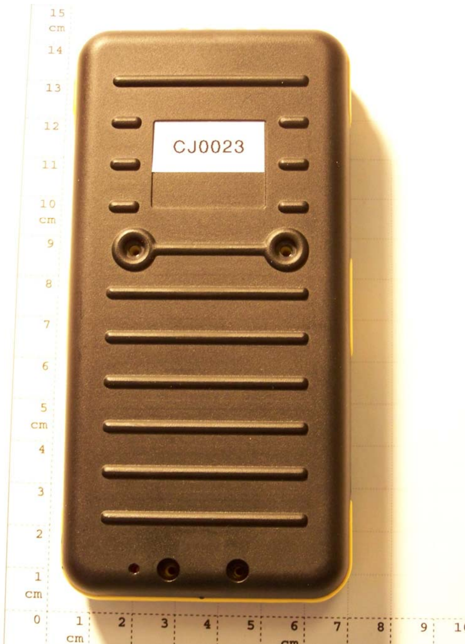
Photograph 2: Equipment under test: EUT A – rear side view