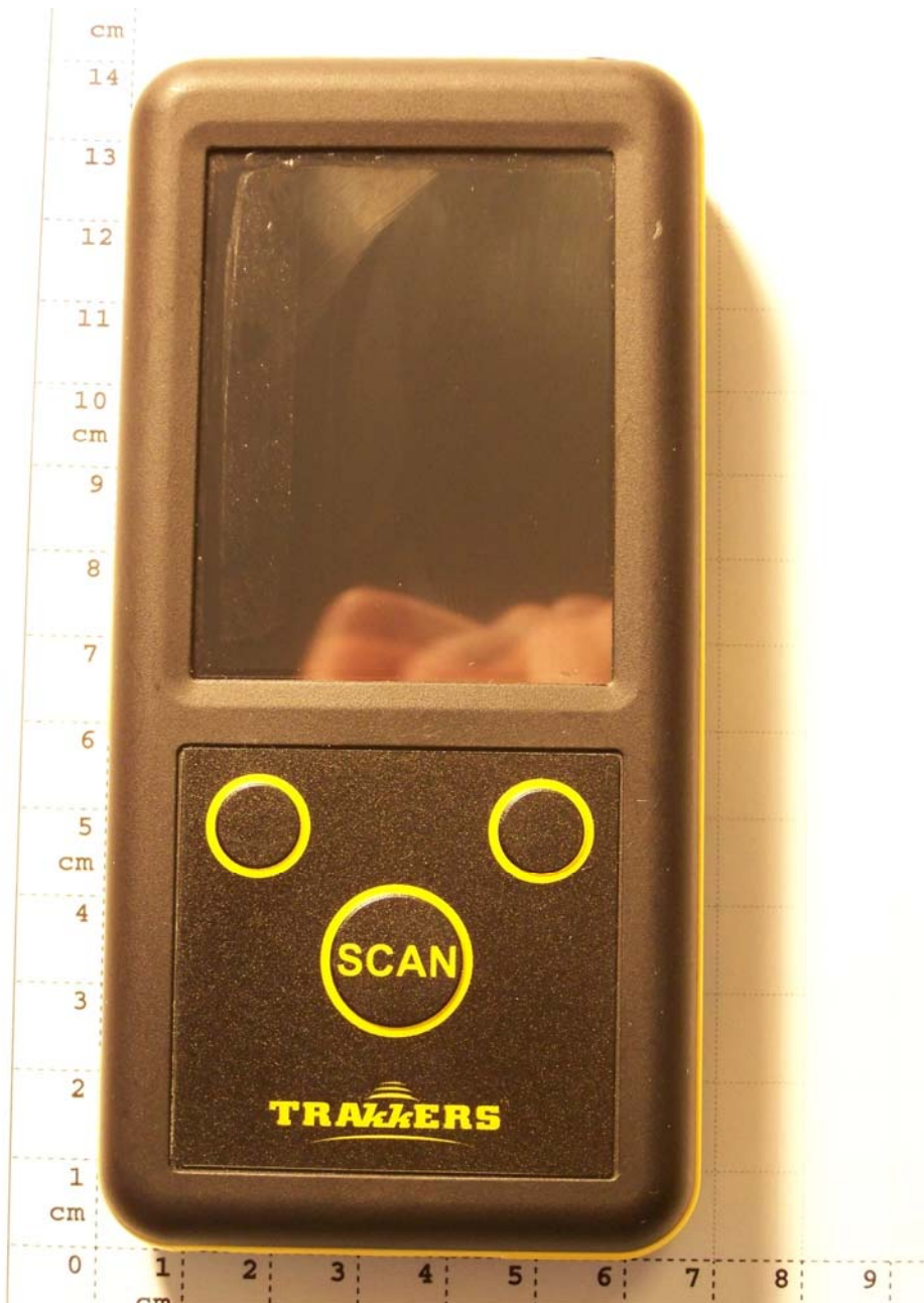
Photograph 1: Equipment under test: EUT A – front side view