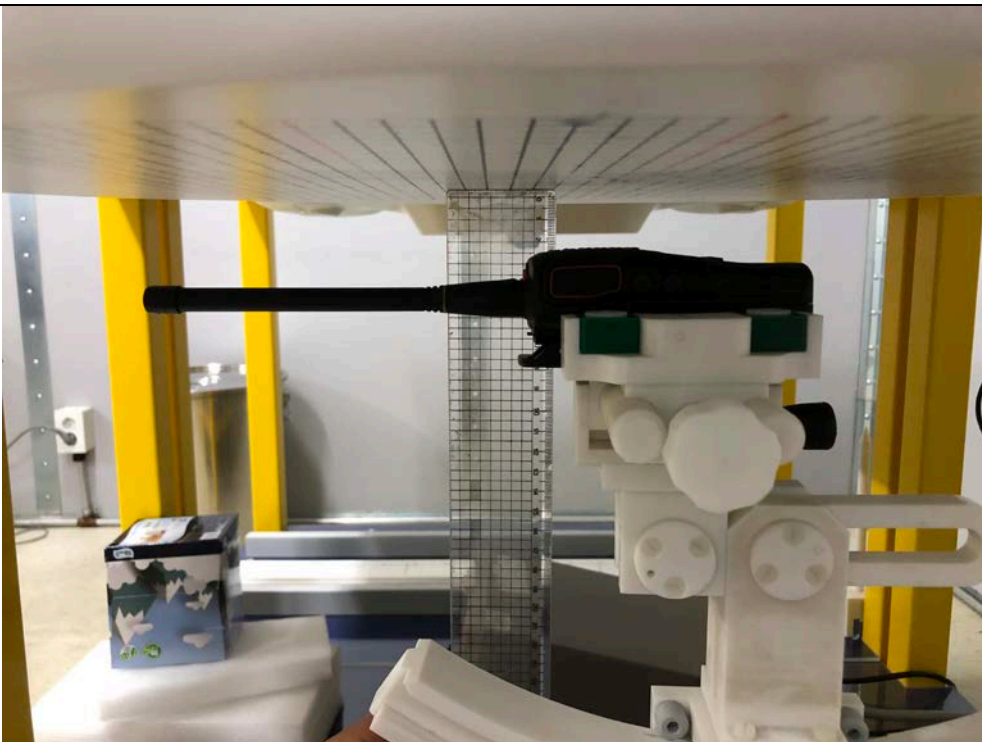
Front of Device 10 mm from Phantom Side view