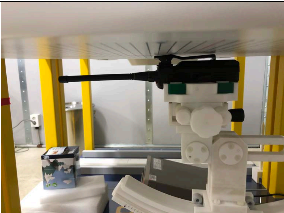
Rear of Device 0 mm from Phantom Side view