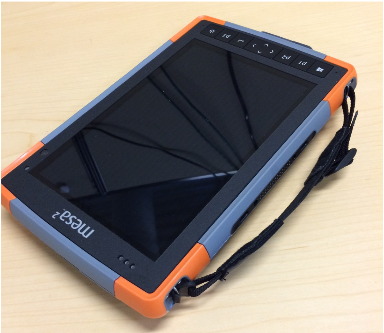
Figure 8: EUT – View 8