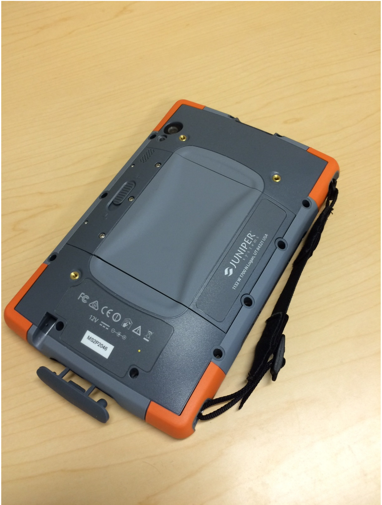
Figure 2: EUT – View 2