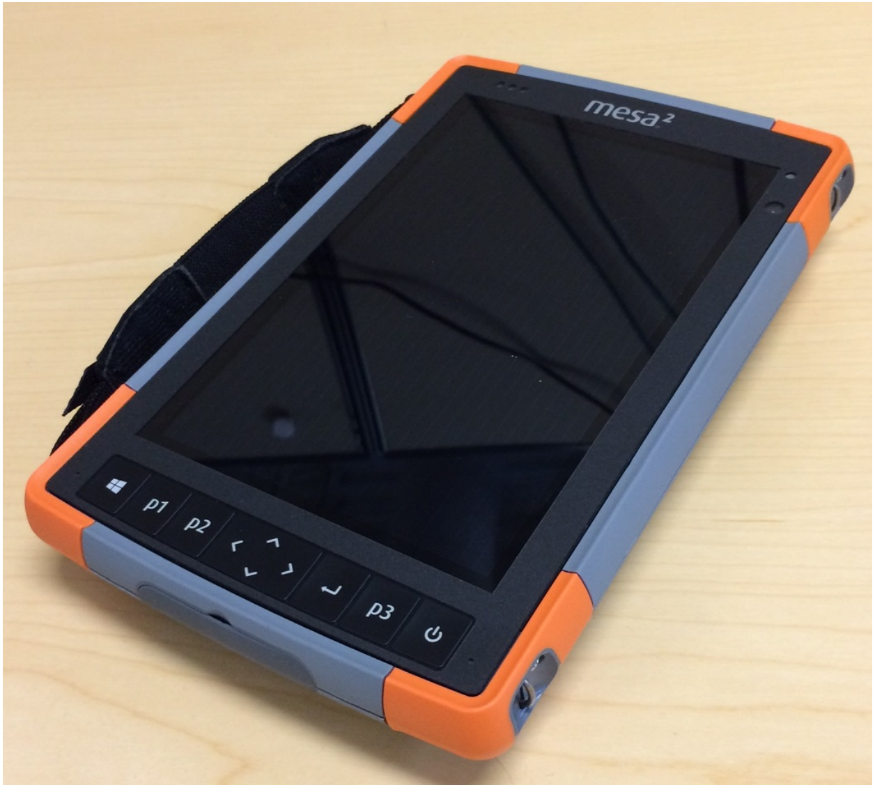
Figure 5: EUT – View 5