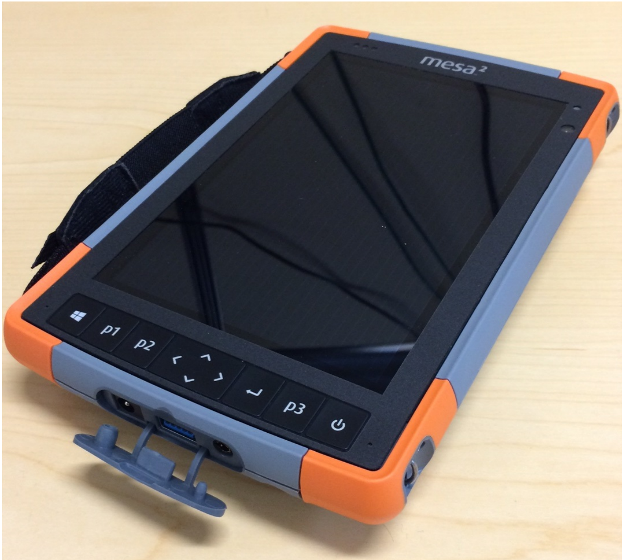
Figure 6: EUT – View 6