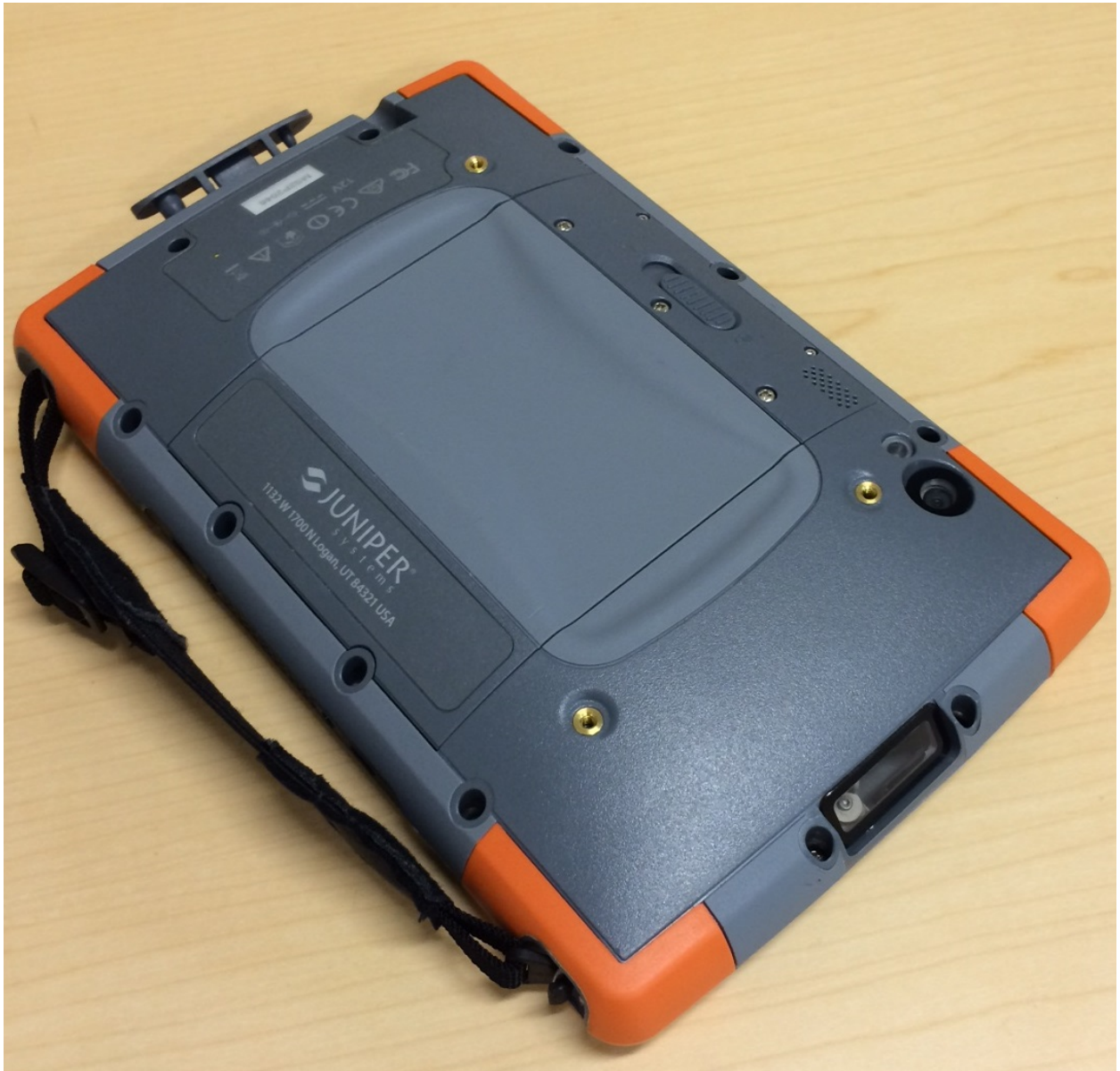
Figure 3: EUT – View 3