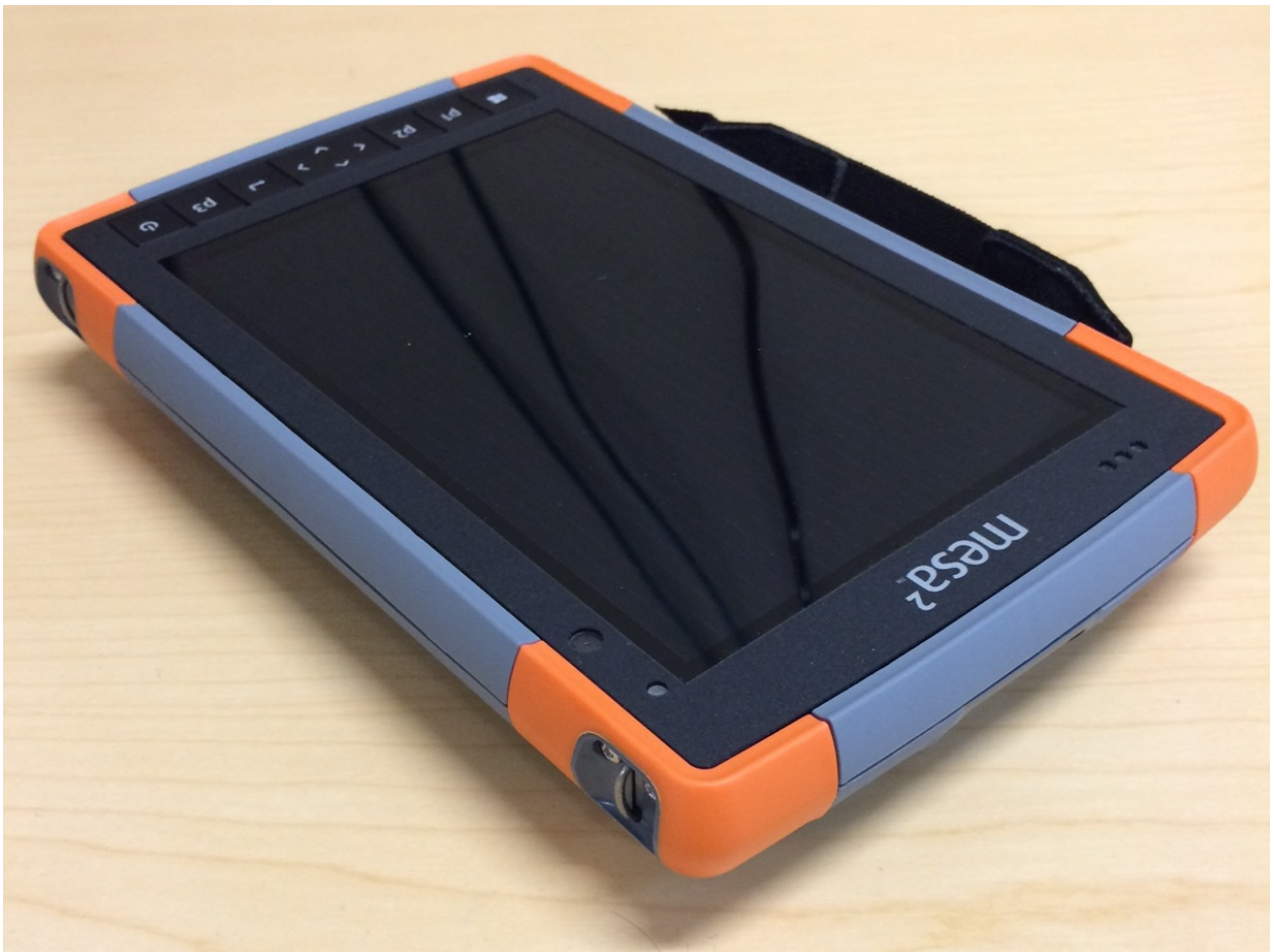
Figure 7: EUT – View 7