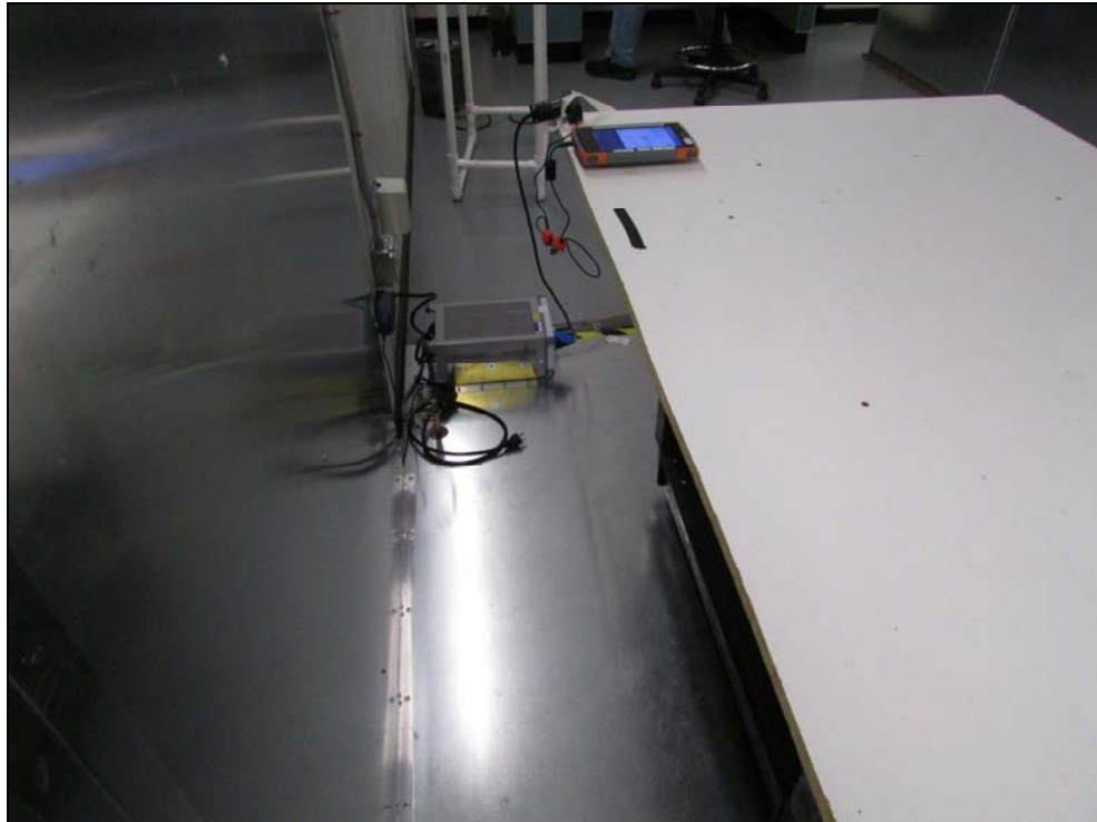
Figure 1: Power Line Conducted Emissions - Back