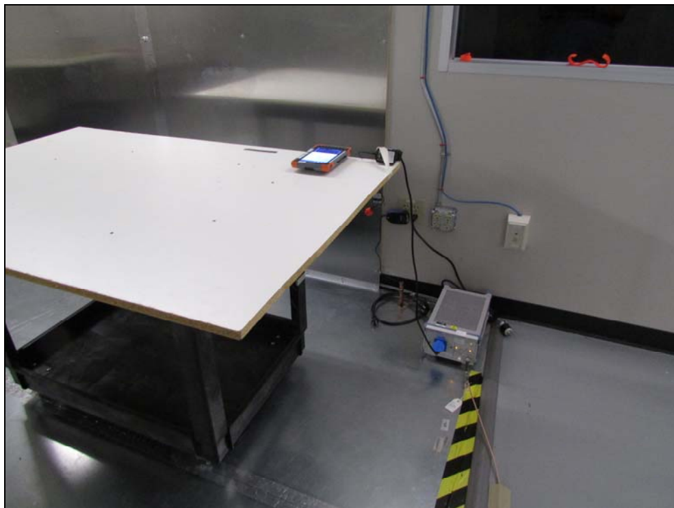
Figure 2: Power Line Conducted Emissions - Front