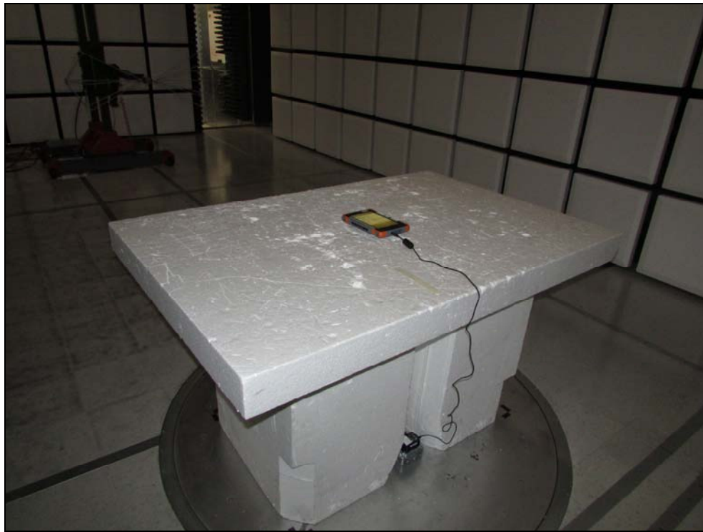
Figure 3: Radiated Spurious Emissions Below 1 GHz - Back