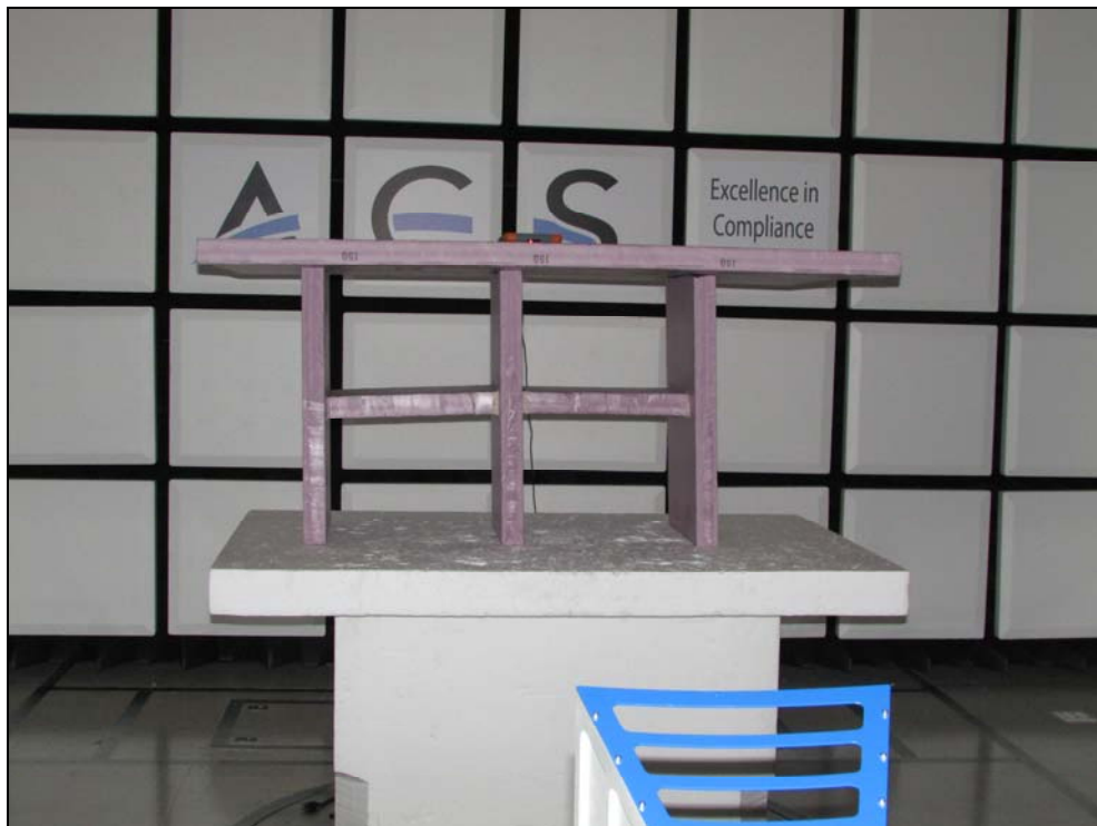
Figure 5: Radiated Spurious Emissions Above 1 GHz - Front