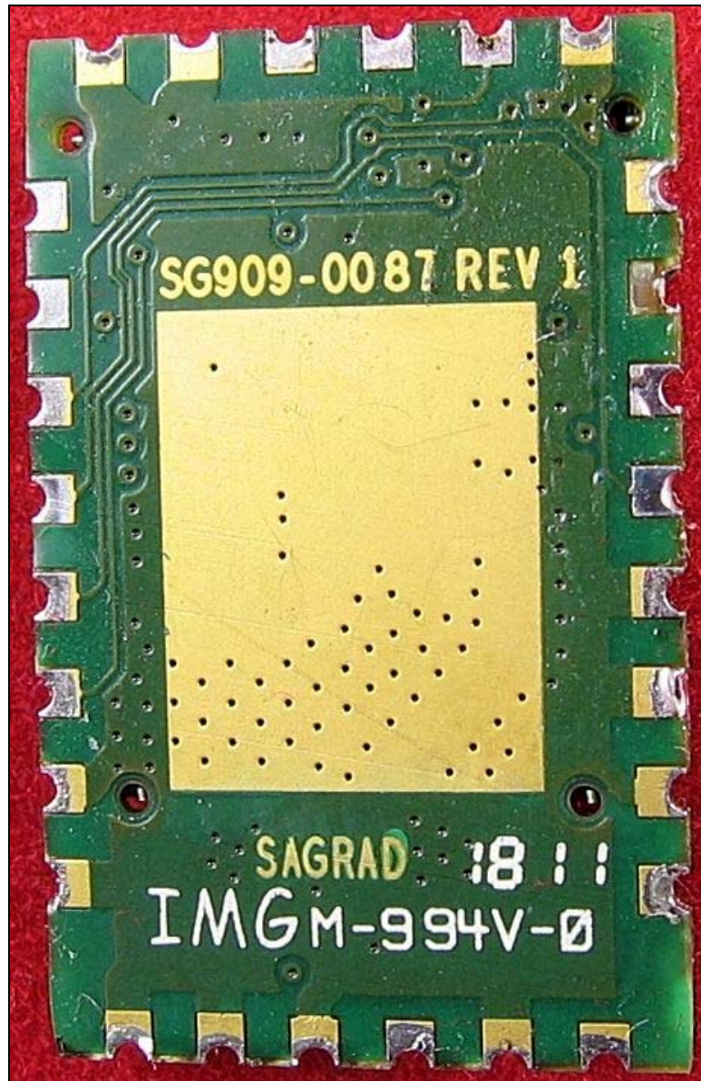
Figure 3: Internal Photo – Back