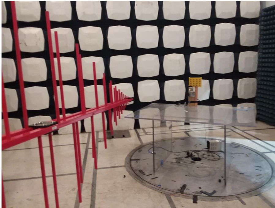
Photograph 2. Radiated Spurious below 1GHz Test Setup, 11dBi Configuration