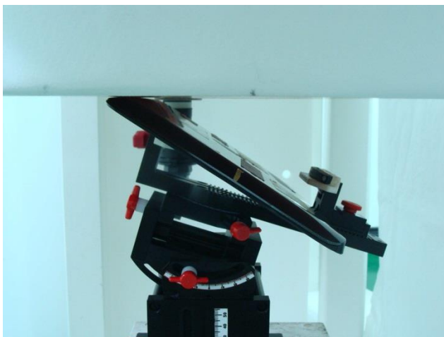
Curved surface of Edge1, Test Separation 0 cm