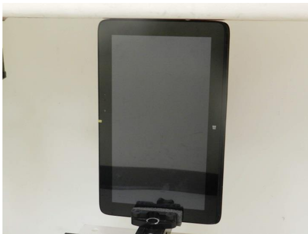
Edge2, Test Separation 0 cm