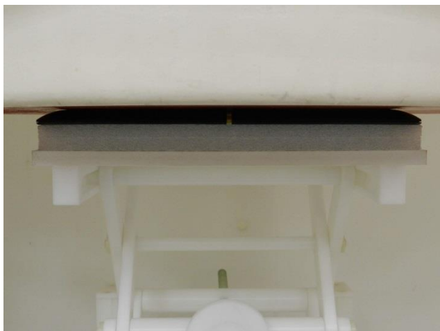
Bottom Face, Test Separation 0 cm