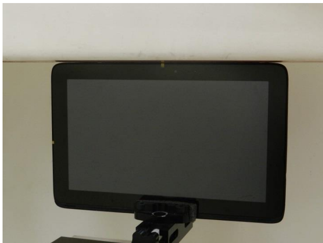
Edge1, Test Separation 0 cm