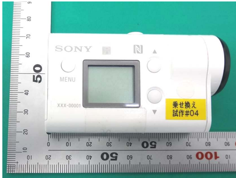
Figure D-3 Overall Dimensions