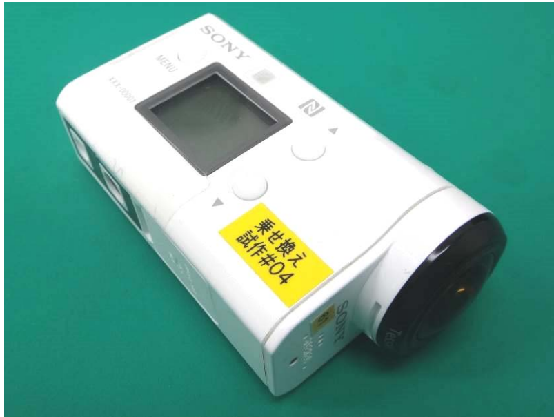
Figure D-1 Front View