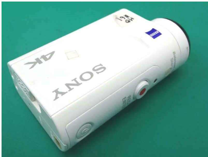
Figure D-2 Back View