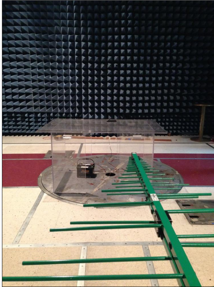
Photograph 1. Radiated Emissions, Test Setup, 30 MHz – 1 GHz