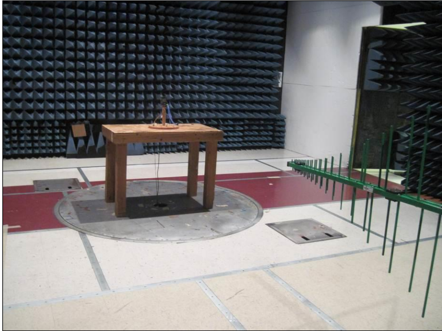
Photograph 2. Radiated Spurious Emissions, 30 MHz – 18 GHz, Test Setup