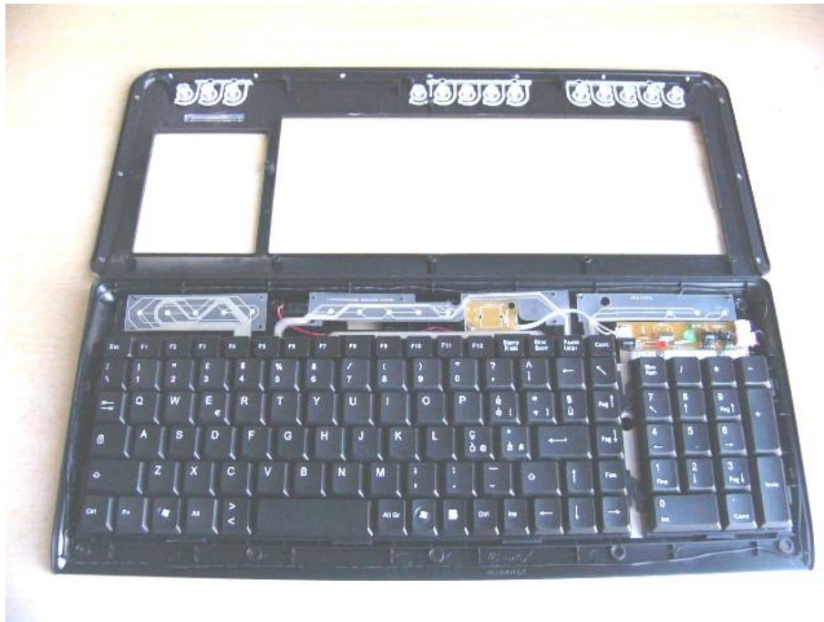
Main board component side