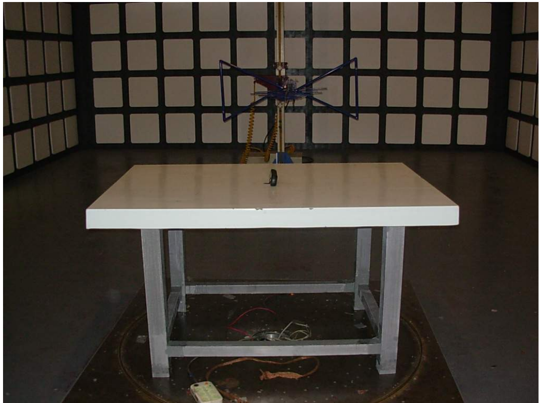
FRONT VIEW OF TEST (SIDE, LOW FREQUENCY)