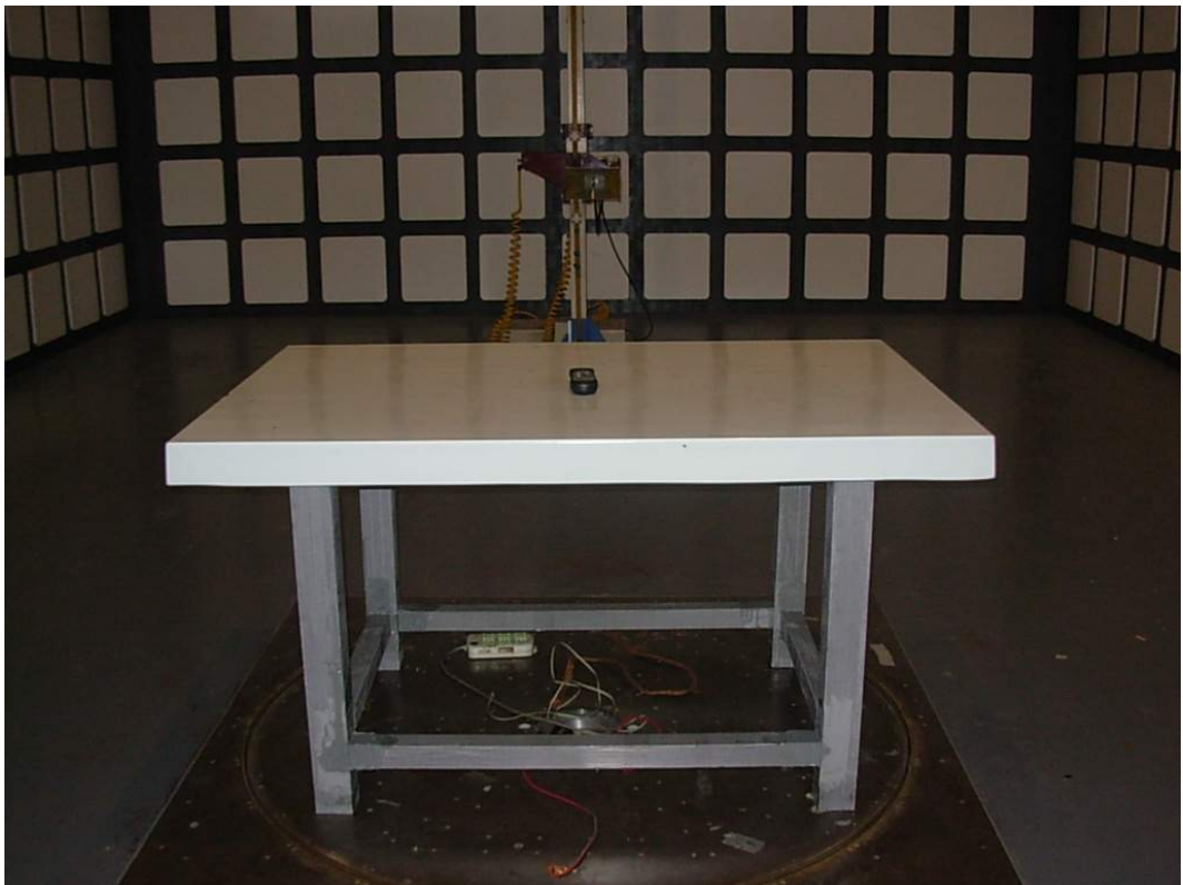
BACK VIEW OF TEST (LYING, HIGH FREQUENCY)