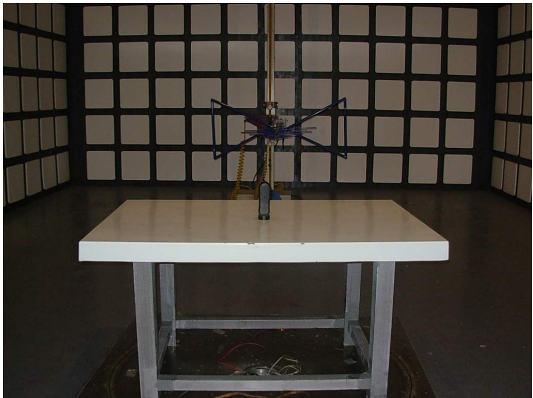
BACK VIEW OF TEST (STAND, LOW FREQUENCY)