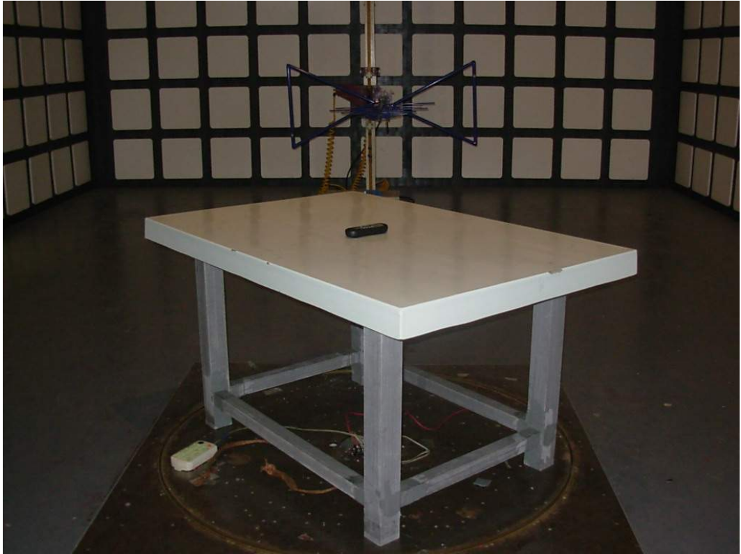
SETUP WITH MAXIMUM DETECTED EMISSION AT HORIZONTAL POLARIZATION (FOR HI SIDE TEST MODE)