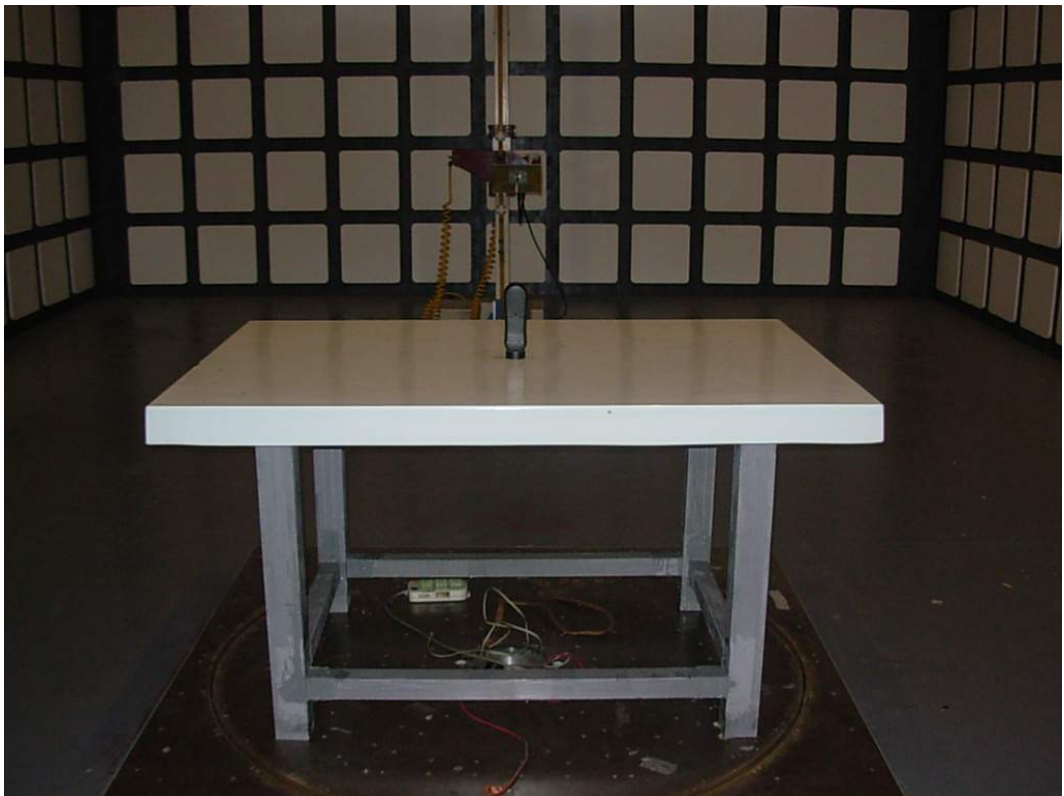
BACK VIEW OF TEST (STAND, HIGH FREQUENCY)