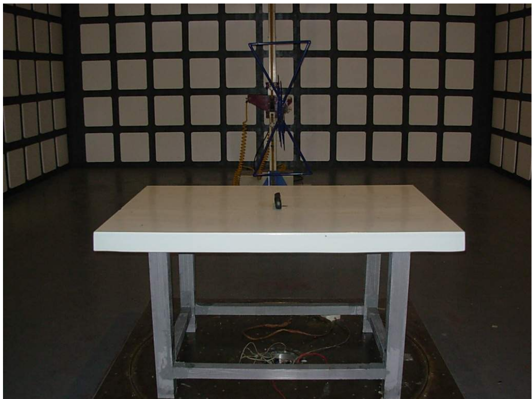
BACK VIEW OF TEST (SIDE, LOW FREQUENCY)