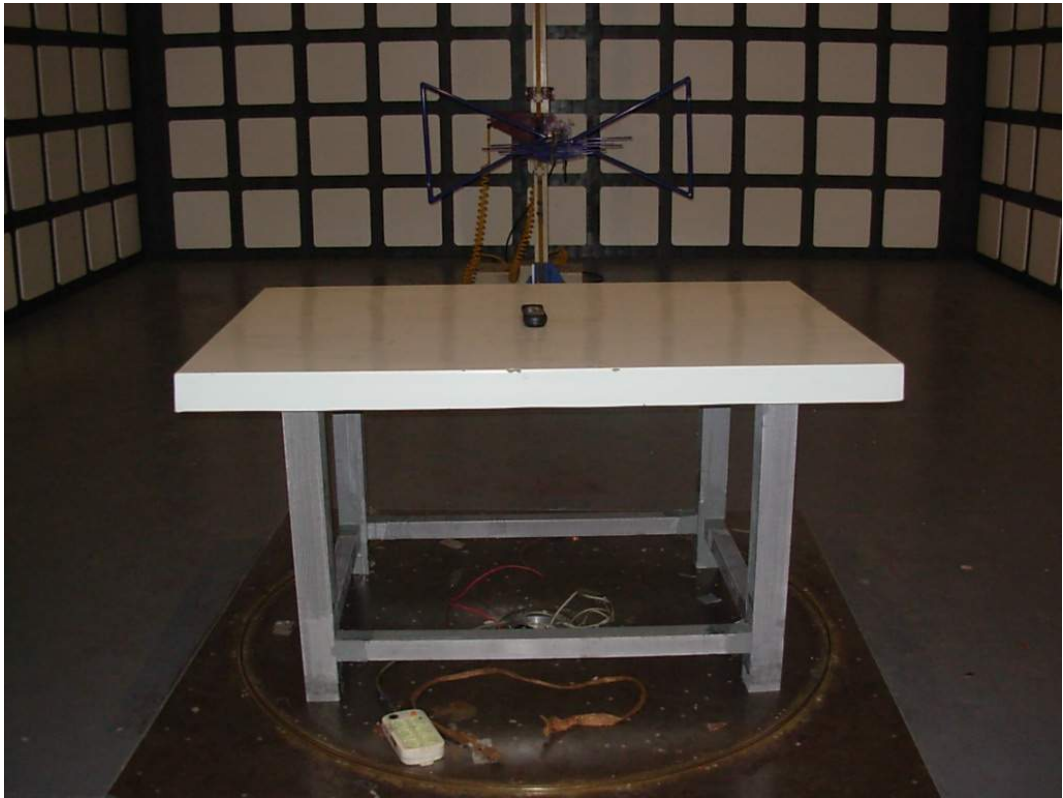
FRONT VIEW OF TEST (LYING, LOW FREQUENCY)