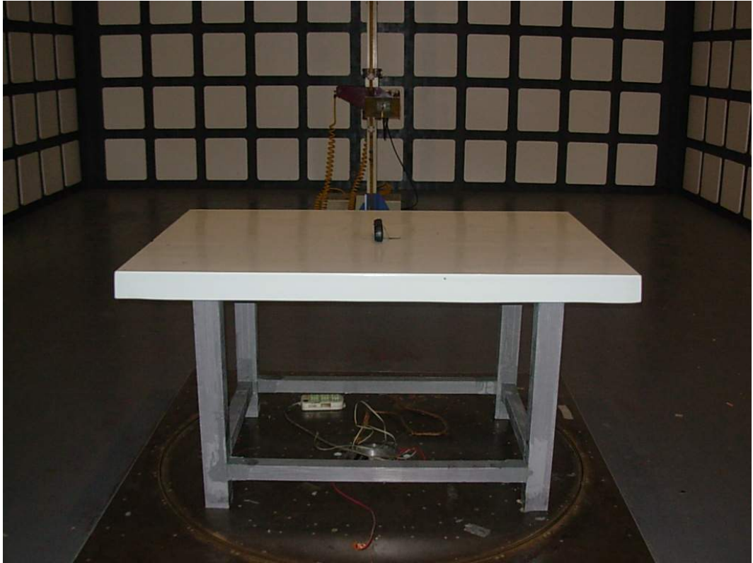
FRONT VIEW OF TEST (SIDE, HIGH FREQUENCY)