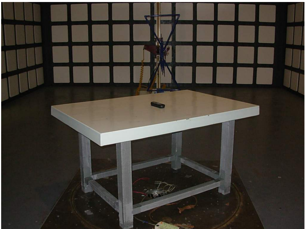
SETUP WITH MAXIMUM DETECTED EMISSION AT VERTICAL POLARIZATION (FOR HI SIDE TEST MODE)