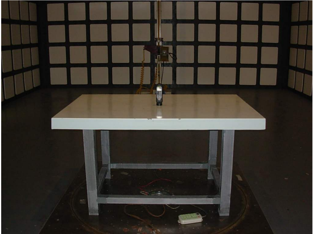
FRONT VIEW OF TEST (STAND, HIGH FREQUENCY)