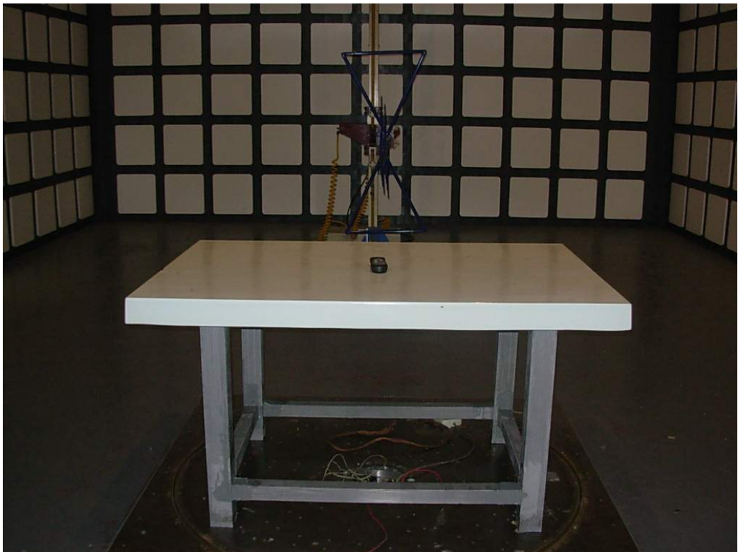
BACK VIEW OF TEST (LYING, LOW FREQUENCY)