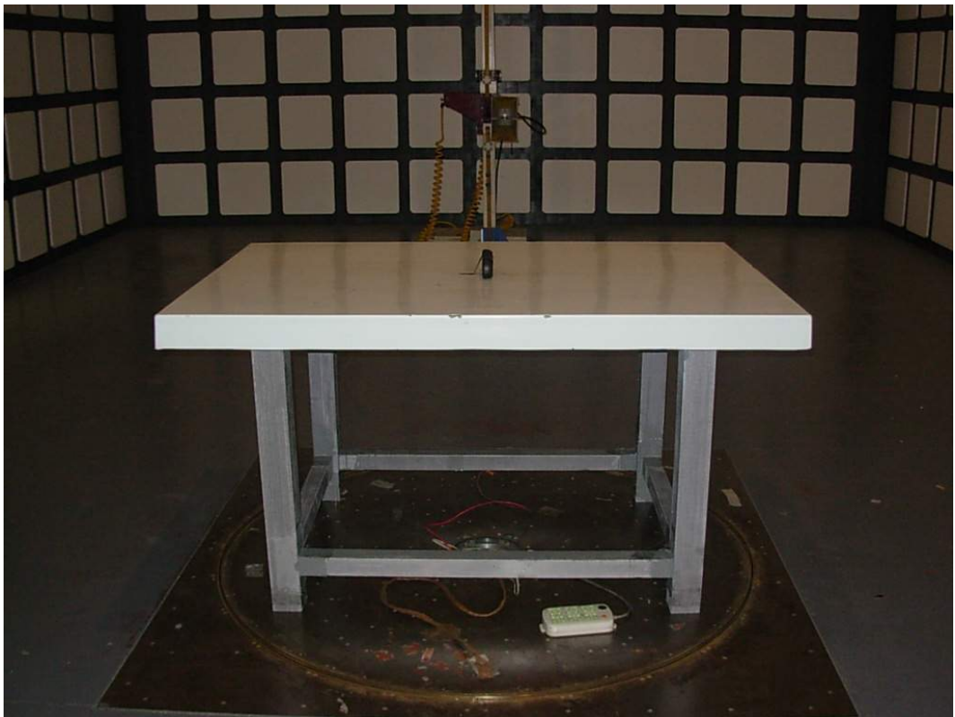
BACK VIEW OF TEST (SIDE, HIGH FREQUENCY)