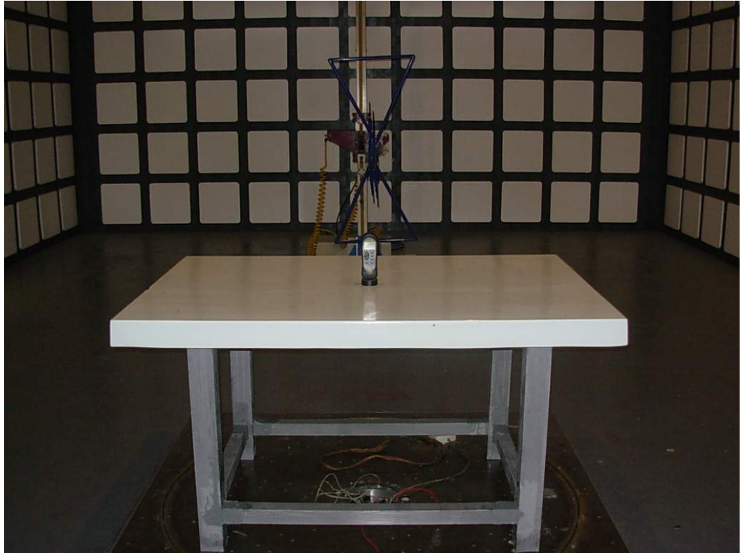
FRONT VIEW OF TEST (STAND, LOW FREQUENCY)