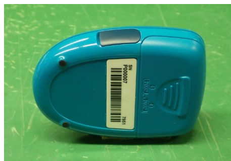
Figure 3 – X-Y Plane

This figure is for reference only and is not representative of the meters tested.