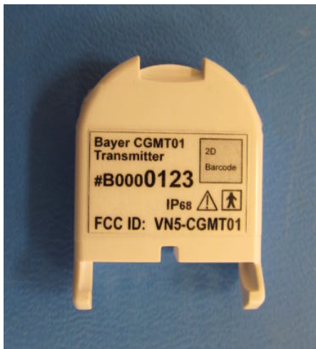
Figure 2 Label Location