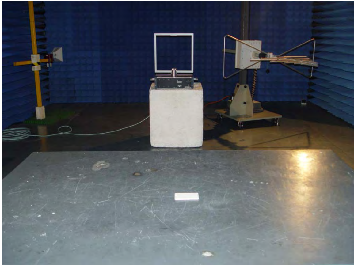
Radiated emissions test 30MHz- 1GHz