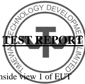
Inside view 1 of EUT