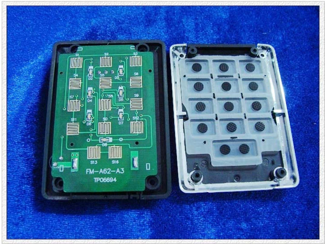
DSC-H10 F3.5 1/10s ISO400