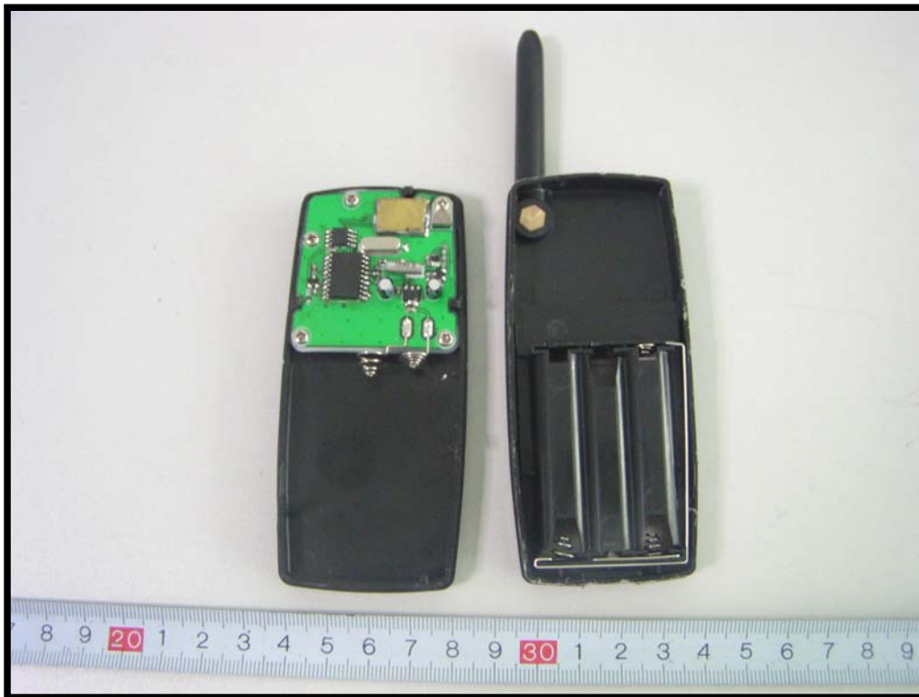
EUT- Main Board Components Top View