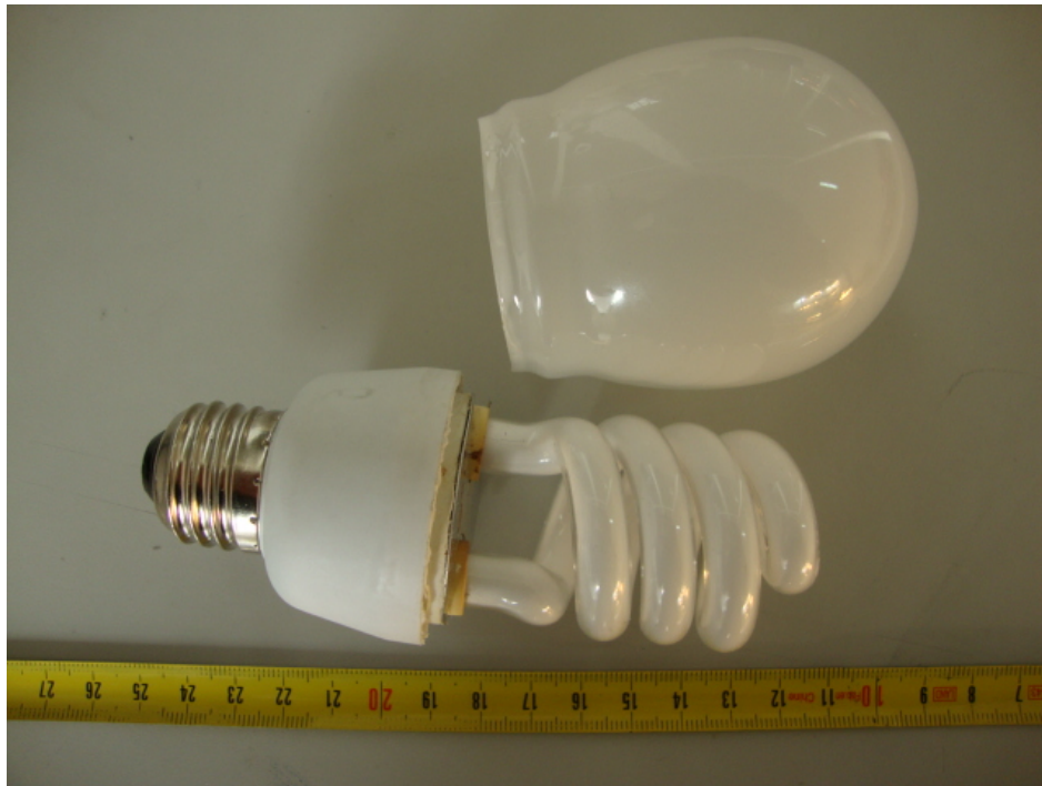
EUT – Cover off View 2