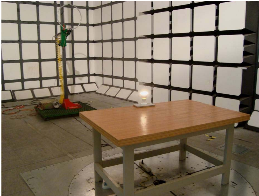
Radiated Emissions - Rear View