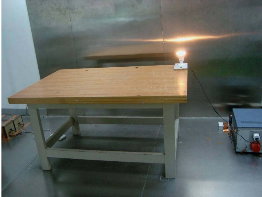
AC Line Conduction Emissions - Side View