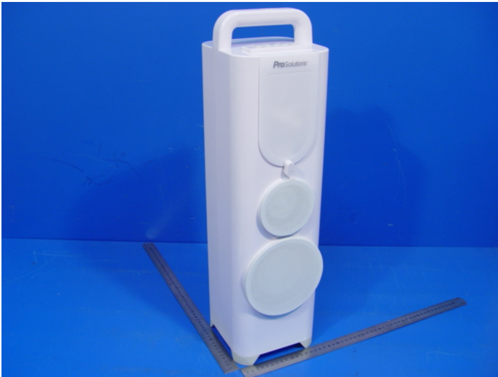
Photo 2 Appearance of EUT