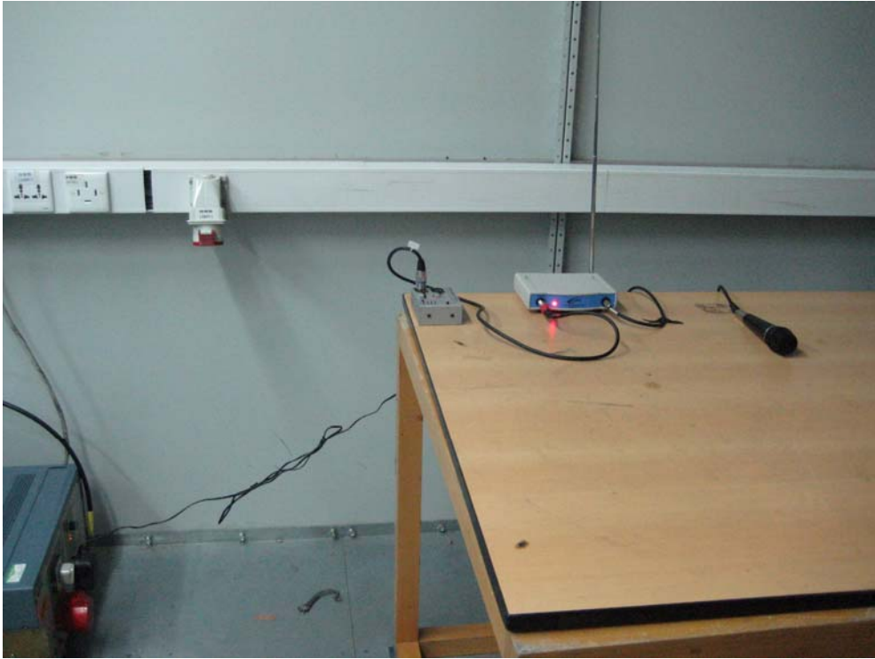
Photo 2 Conducted Emission Test