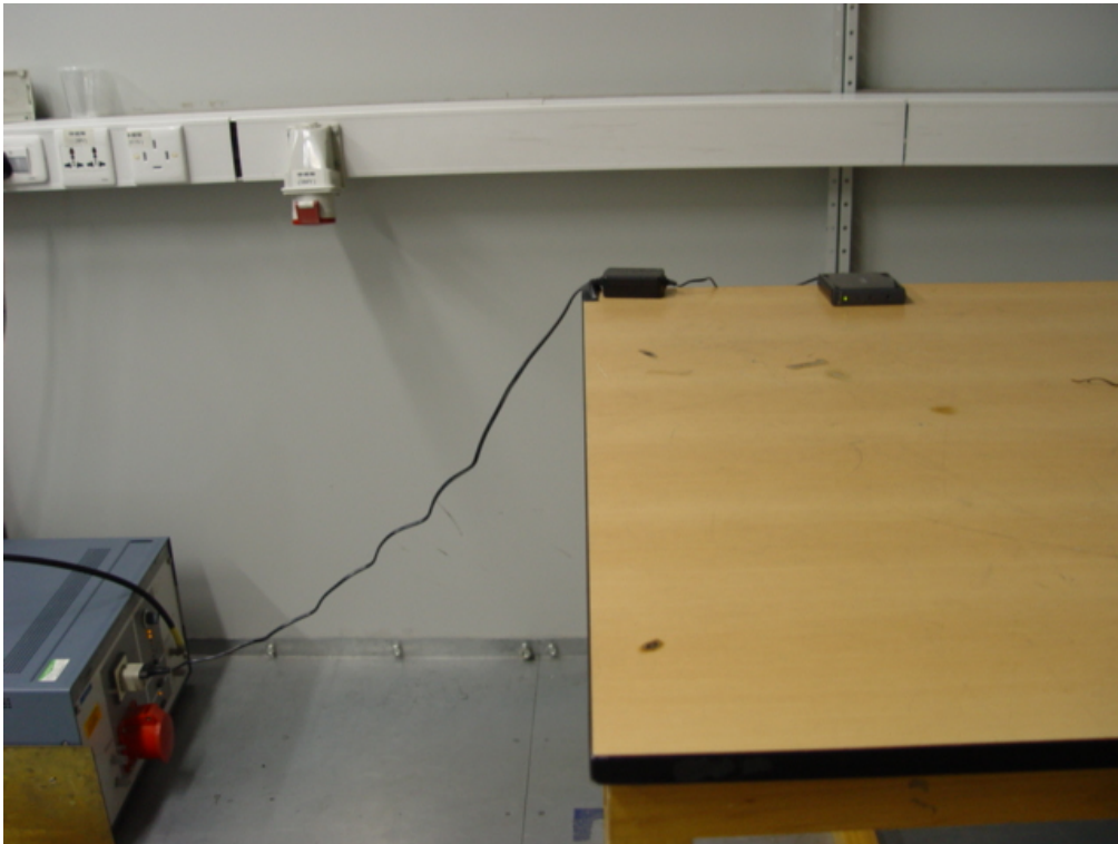
Photo2 Conducted Emission Test