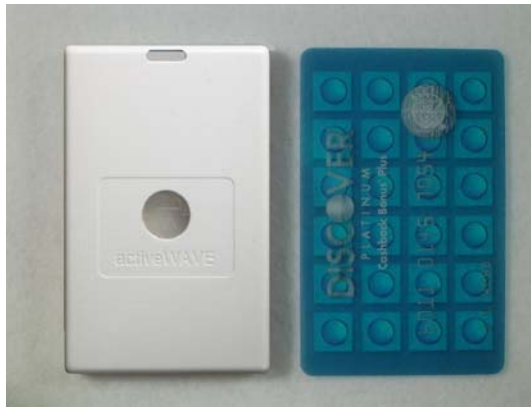
Figure 5: ActiveWave Jumbo Tag