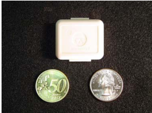
Figure 3: ActiveWave MiniTag