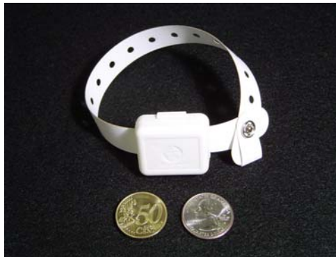
Figure 4: ActiveWave WristbandTag