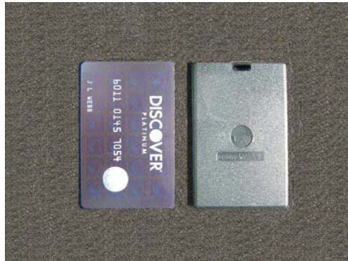
Figure 1: ActiveWave CardTag