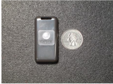
Figure 2: ActiveWave CompactTag