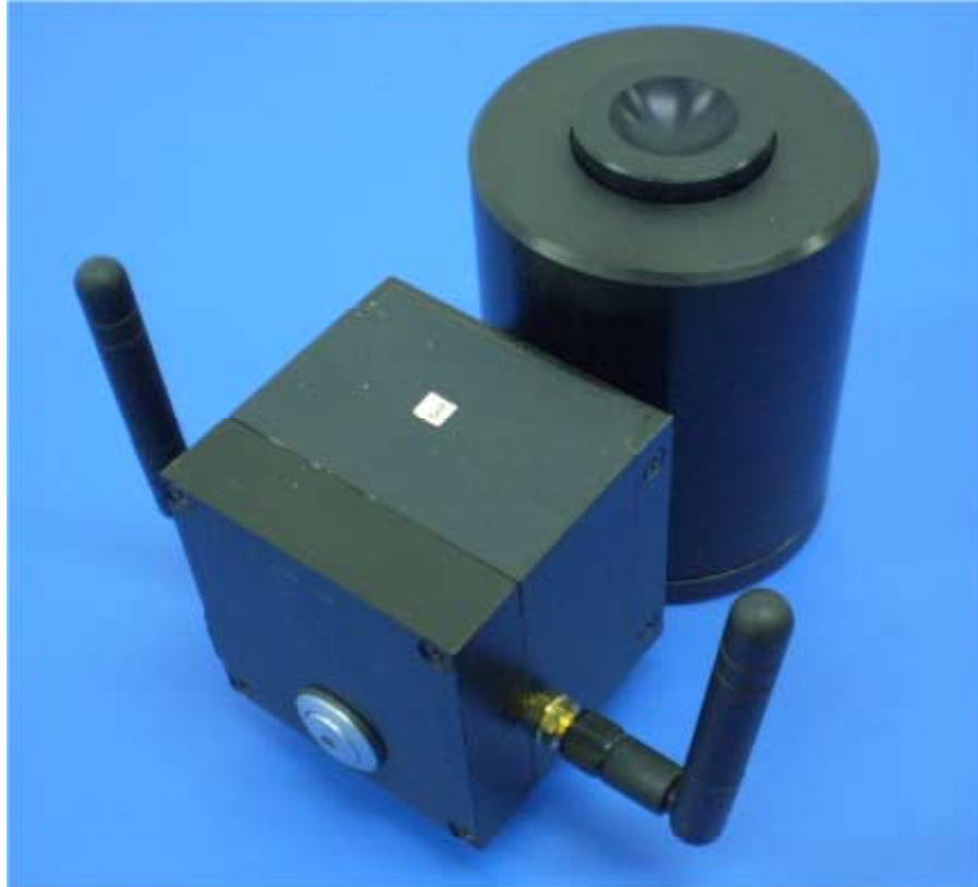
Photograph No.1 Wireless load cell general view