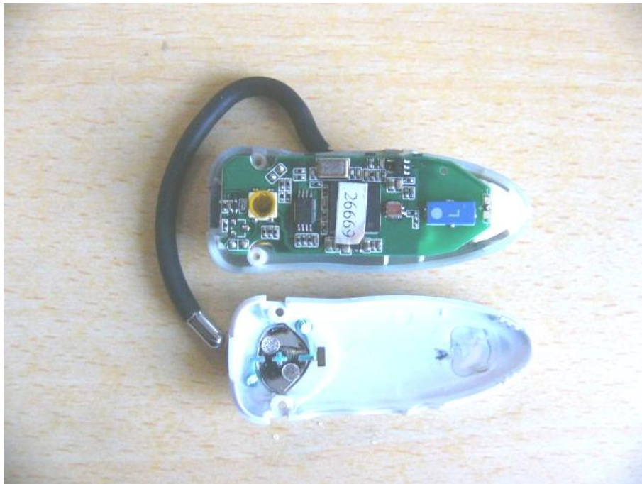
Main & RF board component side