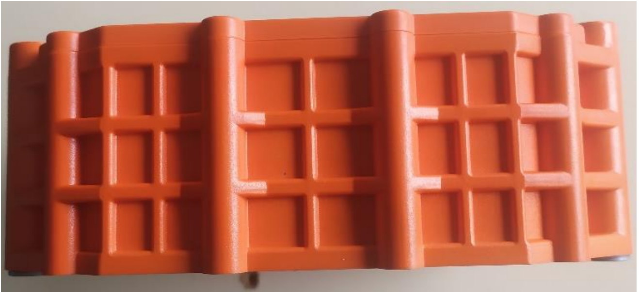
Figure 1 Rear Face