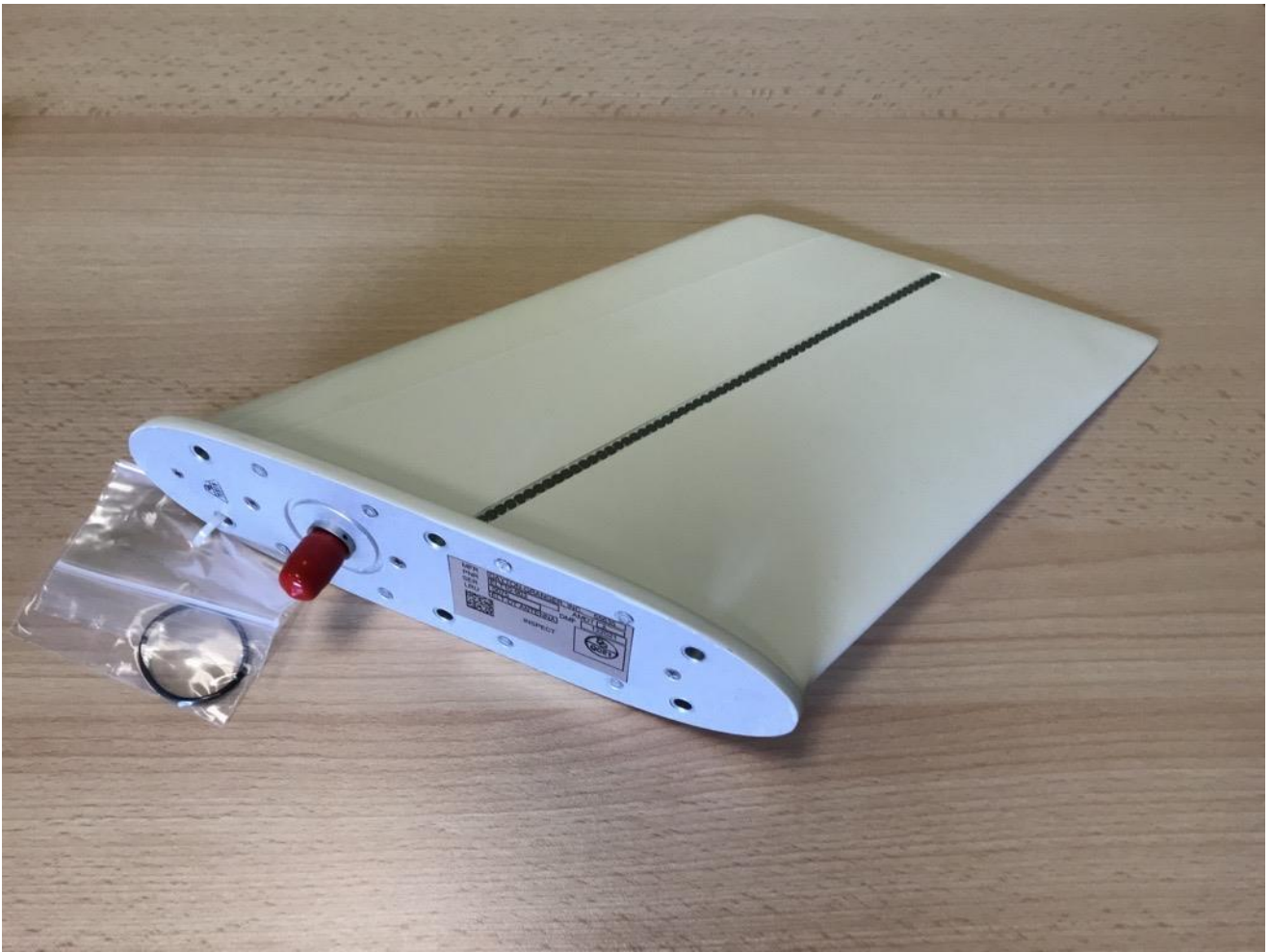
Figure 8 Dayton Granger Antenna