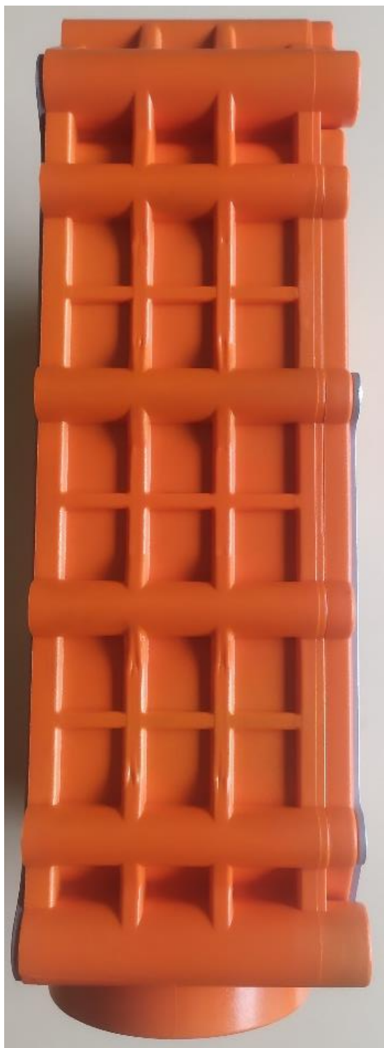
Figure 3 Side face (left)