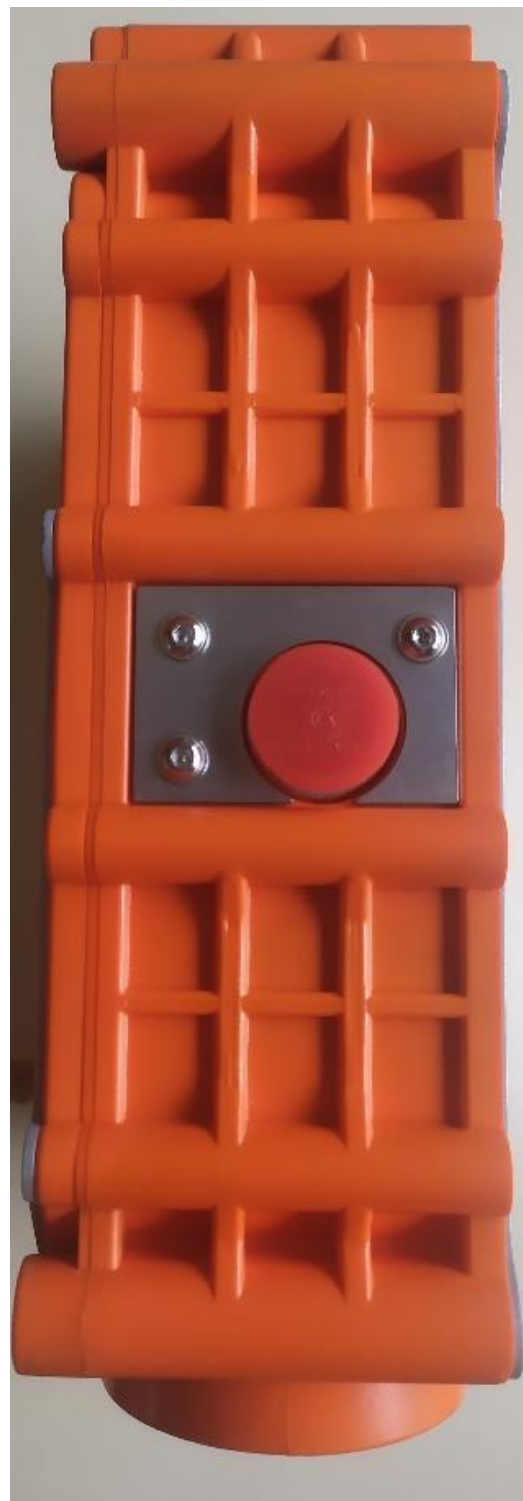
Figure 4 Side face (right)