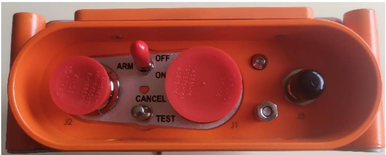
Figure 2 Front Face