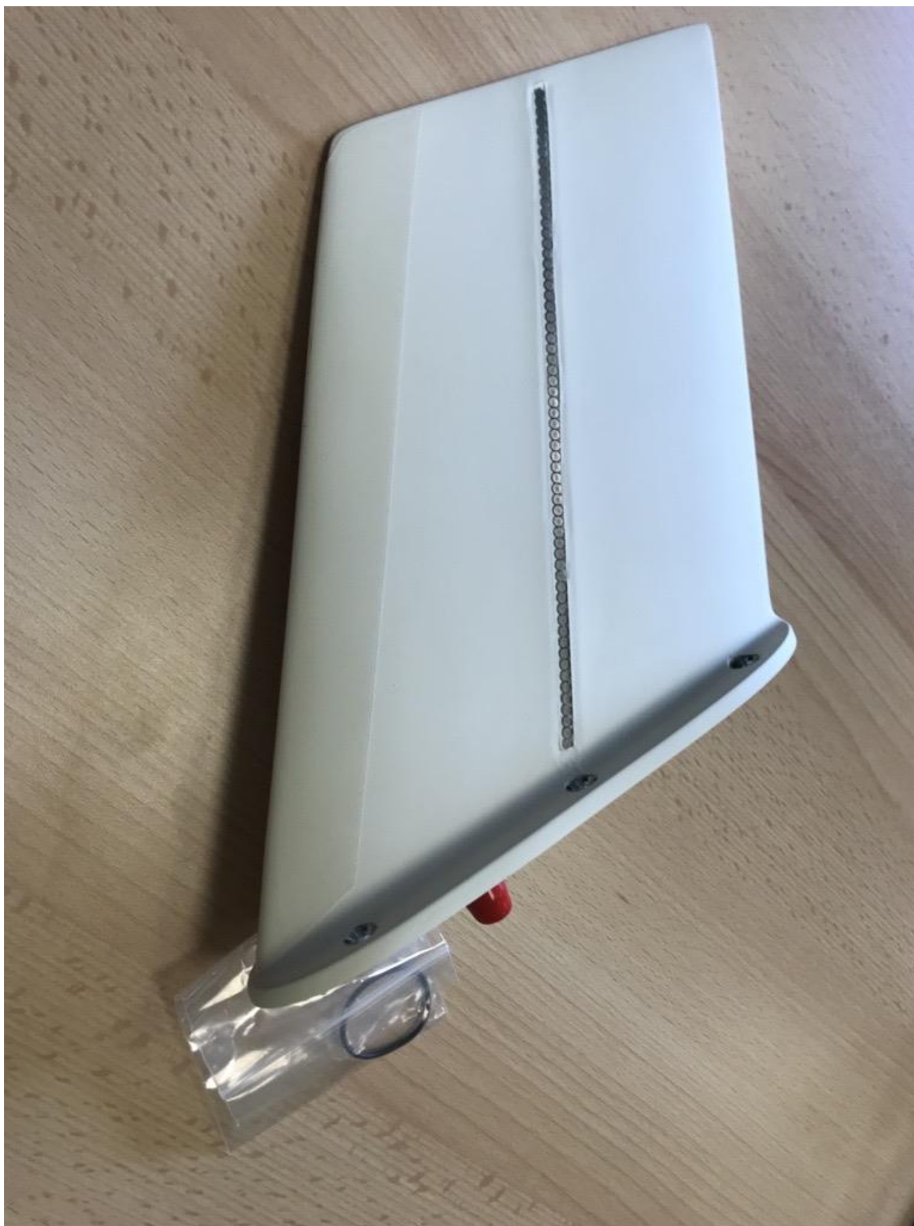
Figure 7 Dayton Granger Antenna