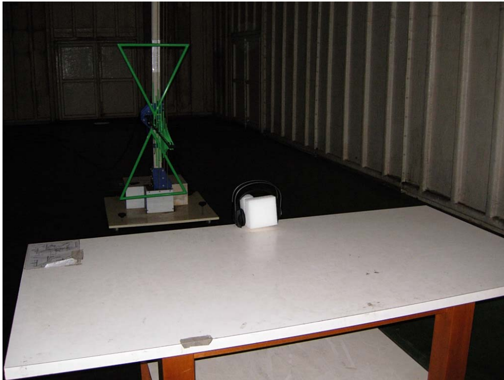
Back View of Radiated Test (Mode1)