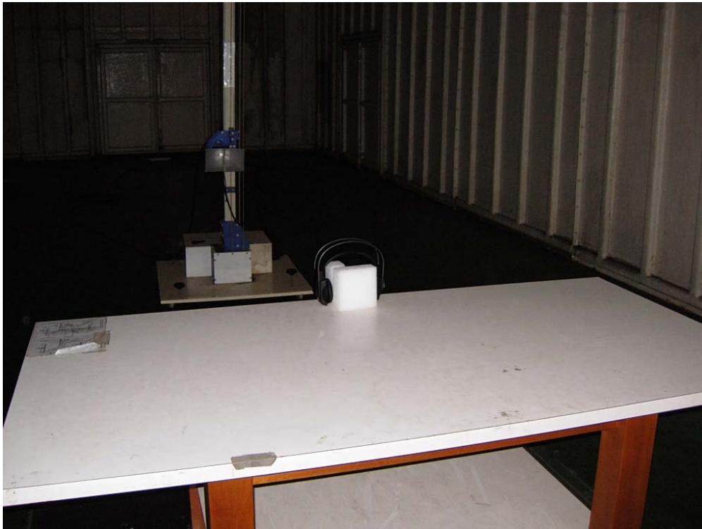
Back View of Radiated Test (Horn-Model)