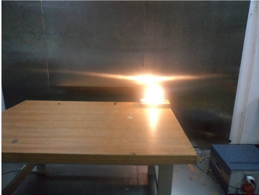
AC Line Conduction Emissions - Side View