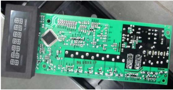
Original Mother board -bottom