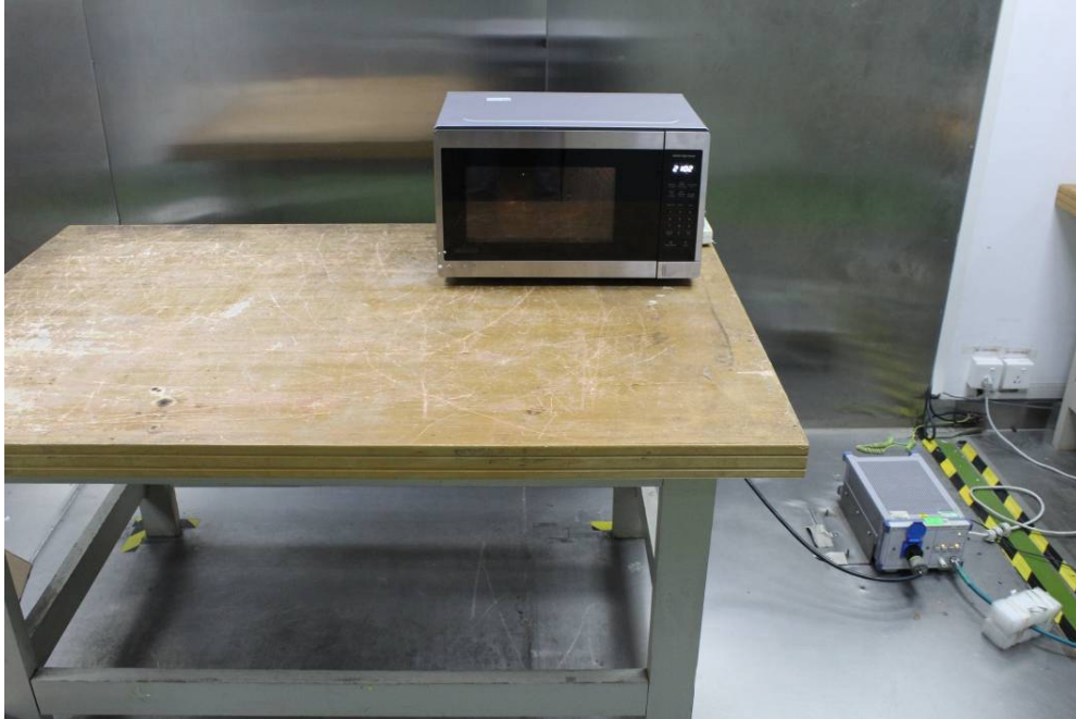
Conducted Emissions - Side View