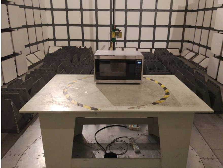
Radiated Emissions - Rear View (Above 1 GHz)