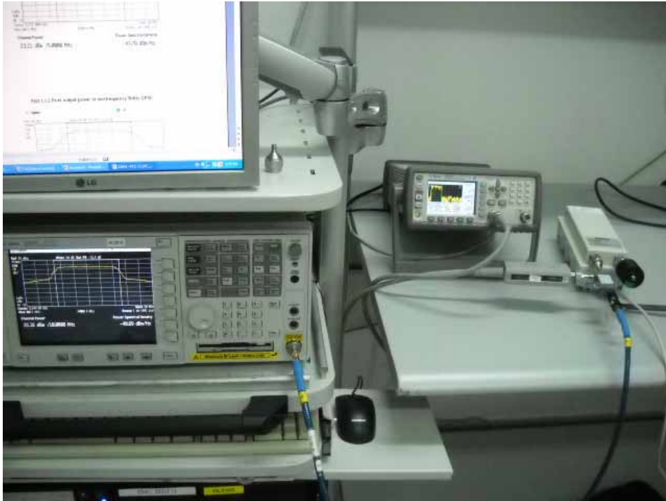
Photograph No.1 Peak output power measurement setup