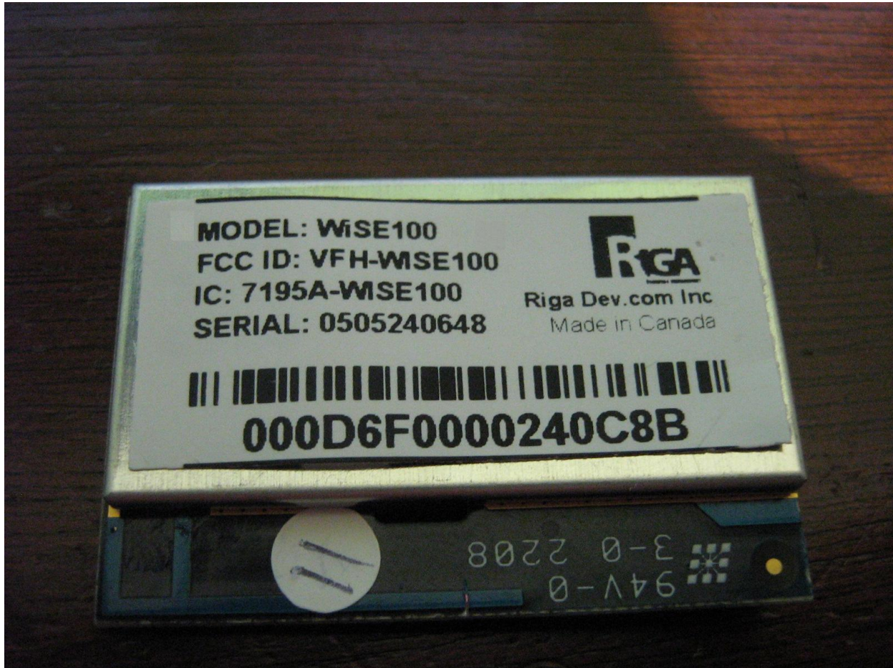
Figure 1 – RF Chip Front

RIGA DEV.COM INC. FCCID: VFH – WISE100 IC: 7195A – WISE100